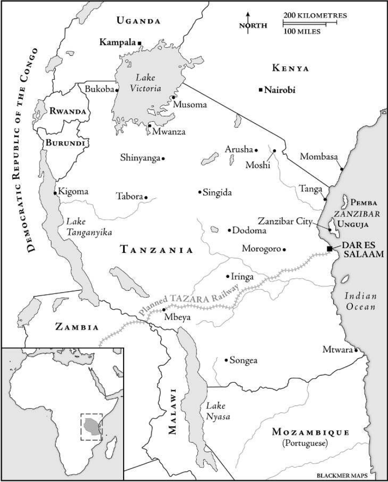
Map 1.1 Tanzania and its neighbours, circa 1968. Map by Kate Blackmer.