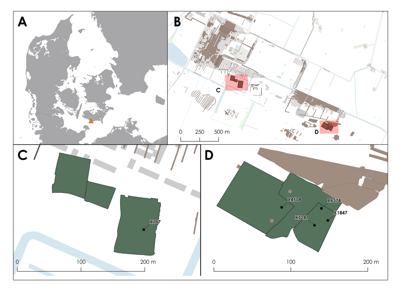
Figure 1 . A) Location of the excavations from the Femern project. B) All excavation trenches from the project (brown) and sampled sites (green). C) Excavation trenches of the site Strandholm I (MLF00909) and find locations of the sampled artefacts. D) Excavation trenches of the site Syltholm II (MLF00906) and find locations of the sampled artefacts.

individual, dating to 3930-3710 cal. BC, from the site Syltholm II (MLF00906-II) (Jensen et al., 2019). Our findings of additional artefacts therefore help strengthen our understanding of the adhesives used at this site.