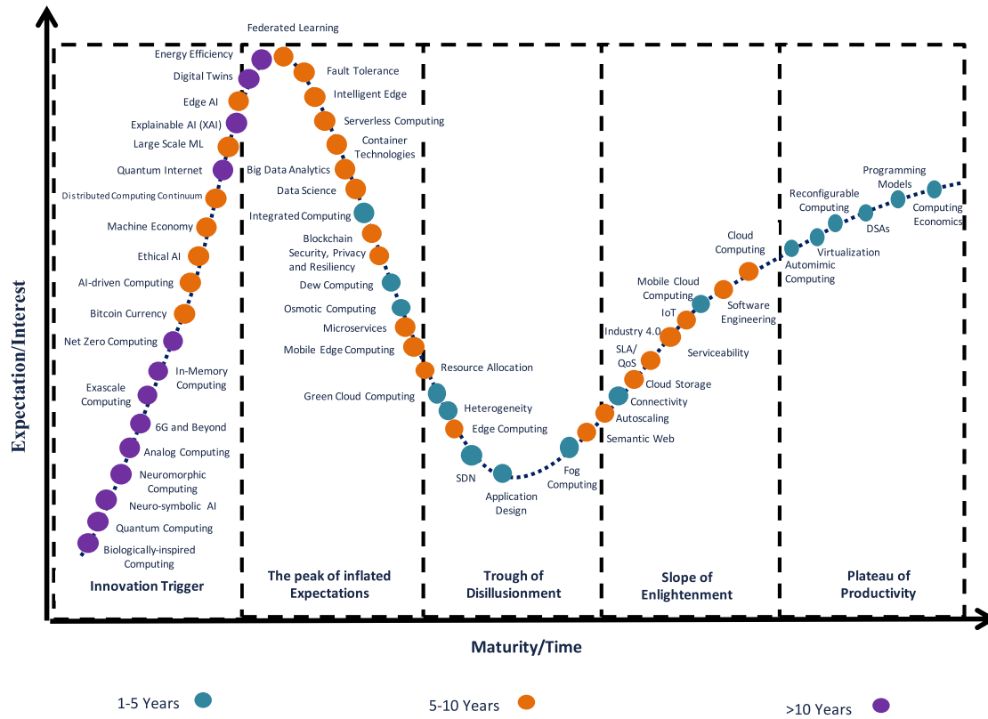
Fig. 2. Hype cycle for modern computing.

Computing, XAI, and the quantum Internet are all expected to be in the spotlight for at least another decade. Digital twins, cybersecurity, edge intelligence, edge computing, and blockchain technology have generated an unprecedented level of excitement. They are expected to be completely built-in under five years with the help of modern technology. Machine Economics, In-Memory Computing, Bitcoin Currency and AIOps/MLOps have all reached their peak of inflated expectations for the following five to ten years of noteworthy evolution. Significant progress needs to be made before biologically inspired computing, neuro-symbolic AI, analog computing, neuromorphic computing, 6G, and quantum computing can be considered hype-worthy. Cloud and fog computing has been trending heavily over the past few years, and that trend could persist for the next five to ten years.