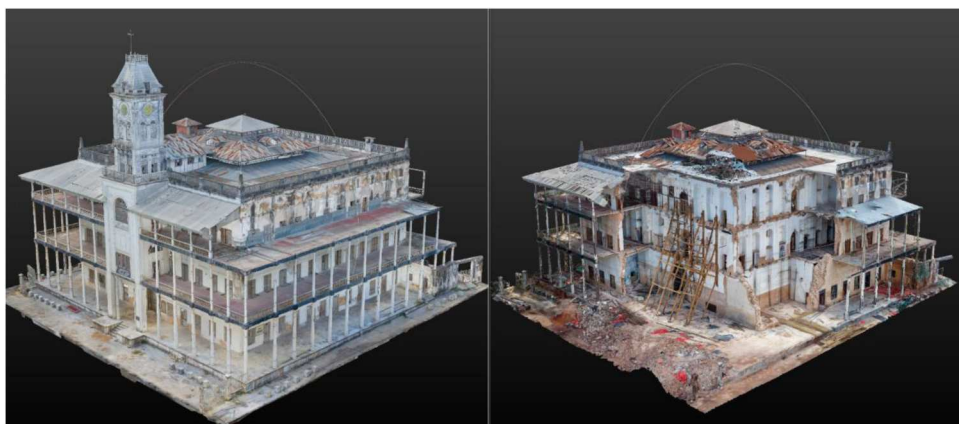
Figure 1. House of Wonders before and after collapse (image produced by the Zamani Project, reproduced with permission).

Wonders, although Oman's Ministry of Heritage and Tourism stressed that work on the structure had not yet begun and was not a contributing factor. 3