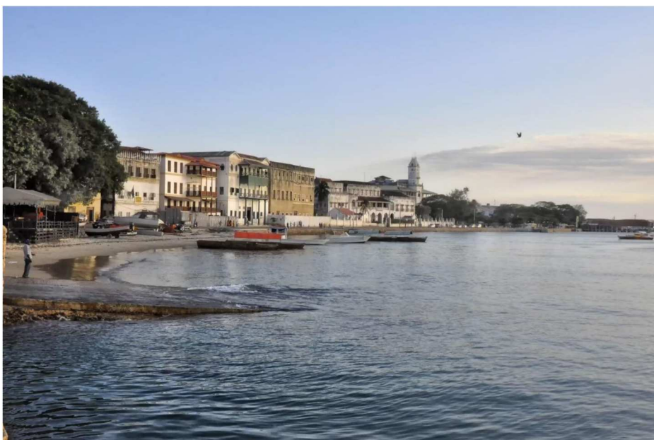
Figure 2. Zanzibar Stone Town waterfront in 2013. Of the buildings and sites visible in this image, several have been part of major restoration projects including Forodhani Gardens, the House of Wonders and the Palace Museum. The former Customs House in the British colonial era (the balconied building to the left) was restored and transformed into a hotel in 2014.

usually public buildings, which are also often those associated by the donors with Zanzibar's global role and cosmopolitan culture, or elements representative of Zanzibari architectural 'styles'. The Old Dispensary, for example, was the first building to be restored by the Aga Khan Trust for Culture on the Zanzibar waterfront. It is described by them as 'a symbol of multi-cultural Zanzibari architecture ... an astonishing hybrid of styles', combining Indian and European neo-classical ornamentation, local coral rag and lime construction. 80 The global connections inherent in Zanzibari architecture are clearly highlighted here as central to the building's significance.