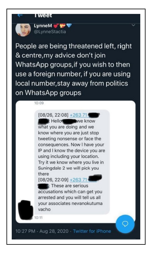
Figure 1. Intentional chilling effects and WhatsApp intimidation.

The leaking of WhatsApp group discussions to the media also serves as a public demonstration of this