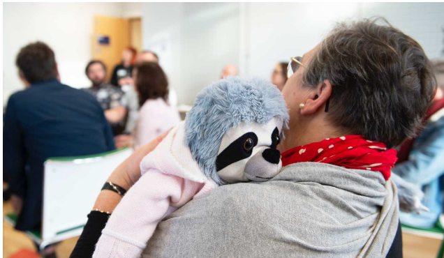
Figure 1: Involvement Activities - The 'hacked' Hug

To address this while providing agency and independence to users, we have trialed a safe stop control that is clearly signposted and tested by users early in the development of their relationship with a device.