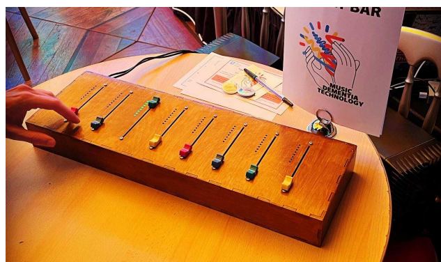
Figure 3: The SliderBox

We wanted to borrow from known interaction metaphors and in previous involvement activities the 'Mixing-Desk' was discussed as a familiar musical, technological and cultural object. Within this design space, considerations were made from visual and dextral impairment. The interface was kept as uncluttered as possible with no additional interface elements than the 8 sliders, which were spaced farther apart than commonly found and later colour coded to provide some differentiation within a repeating interface.