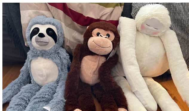
Figure 4: The Hug (right) [38], and our 'hacked' soft tech

We explored notions of comfort and intimacy mediated through musical and sonic interactions and uncovered the desire for personalisation and sharing of the experience with others.