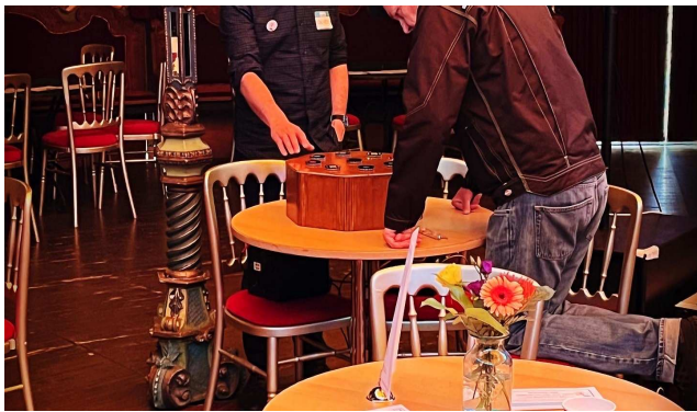
Figure 5: Involvement Activities - In C Box