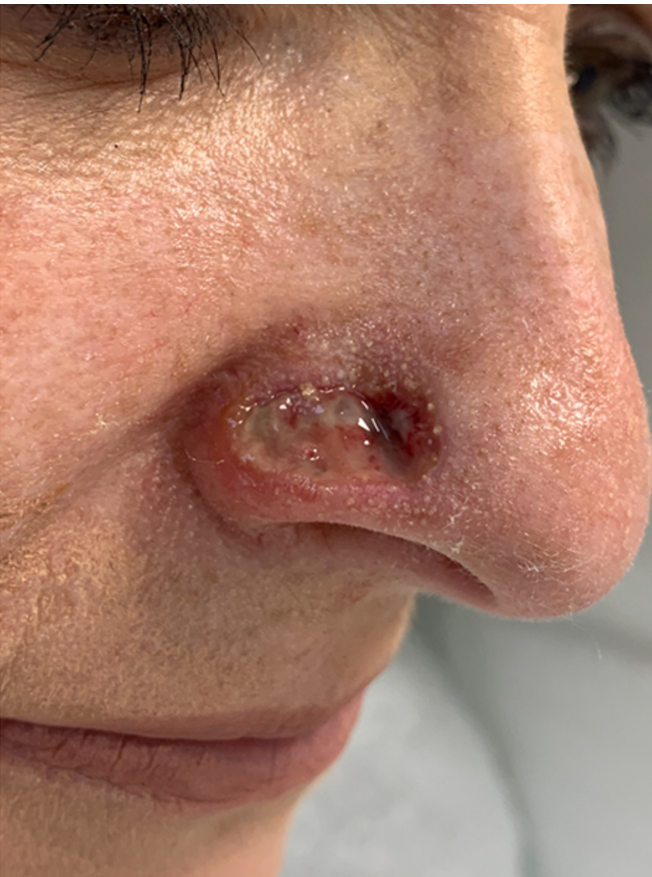
Fig 3 | The minimum focus distance at which a mobile device camera can focus is usually around 8-12 cm. When photographing small lesions, it is tempting to breach this distance to show the lesion close up. This results in focus past the area of interest (left image). With the increase in resolution of modern devices, photographing the lesion further away and then zooming in retains sharpness and clarity (right image zoomed to 100%)