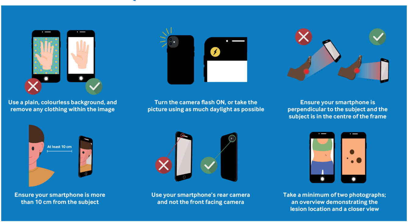
Fig 1 | Quick reference guide to the key principles of medical photography, for both patients and clinicians