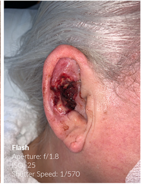
Fig 2 | Lighting postoperative photographs of a patient's ear after tumour removal, taken to aid discussion with secondary care over the assessment of granulation tissue. Left. Image was taken with a low degree of ambient light and no flash, leading to the camera setting a slow shutter speed resulting in motion blur. Middle. The introduction of daylight reduces in motion blur, but the angle of the light combined with the shape of the ear creates multiple shadows. This makes it difficult to identify the presence of healthy granulation tissue and absence of desiccation necrosis. Right. Turning on the flash to increase the quantity of light allows the mobile device to use a faster shutter speed and lower ISO while also providing more effective cavity illumination due to the close proximity of the flash to the camera lens.