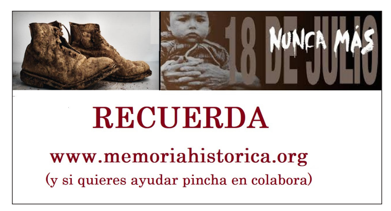
Figure 7: Flyer from Asociación por la Recuperación de la Memoria Histórica, a non-profit organisation that works to recover testimonies of war in Spain, captured in 2020. The caption reads: "If you want to help us, click on 'collaborate'" (currently hosted at memoriahistorica.org.es).