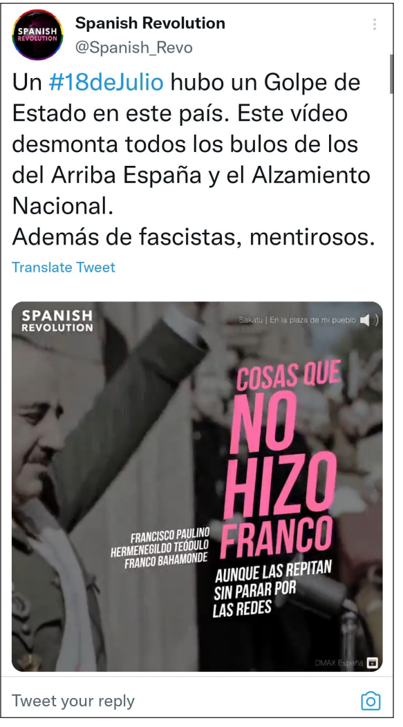
Figure 4: Tweet and video shared by Spanish Revolution, debunking the fascist disinformation campaign. July 18, 2021. The post reads: "On 18 July [1936] there was a military coup in this country. This video debunks all the fake news from the [defenders of fascist slogans] Arriba Espana [Up with Spain] and Alzamiento Nacional [National Uprising]."

responded to a social media disinformation campaign from the far-right by tweeting a thread addressing 14 of the common myths about the Franco dictatorship in relation to the economic and social development of Spain, with evidence from historical sources such as law texts and archives. In 2021, the online activist group Spanish Revolution (@spanishrevorg 2021) tweeted an online video titled "Things that Franco didn't do – even if they are constantly repeated online" on the anniversary of the coup. The video reinstated the content of the thread with a more social media-friendly format (see Figure 4). However, neither of these initiatives stopped the spread of the original disinformation campaign.