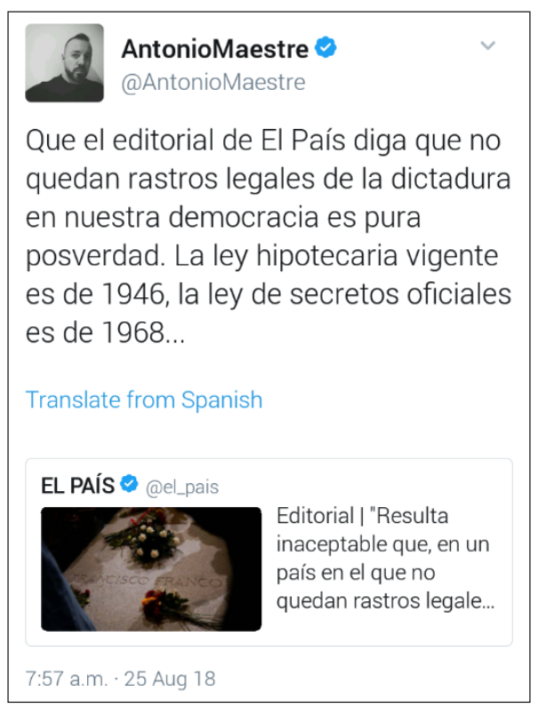
Figure 6: Maestre's tweet defining an article from El Pais as post-truth. The post reads: "The editorial from El Pais saying that there are no legal traces of the dictatorship in our democracy is pure post-truth. Our mortgage law is from 1946, our State secret law is from 1968..."