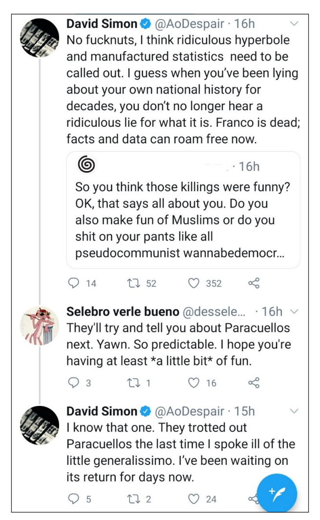
Figure 3: Twitter conversation between David Simon and a Spanish tuitstar about the repetitive nature of these online arguments about the dictatorship. August 10, 2020.

Suddenly you are in the Twilight Zone of right-wing Spanish Twitter, where the prevalence of non sequitur makes you doubt what you have written in the first place, only to be slightly outdone by tin foil hat-wearing separatists who will swear a Catalan invented the lightbulb. Enjoy your stay. (Tweet anonymised)