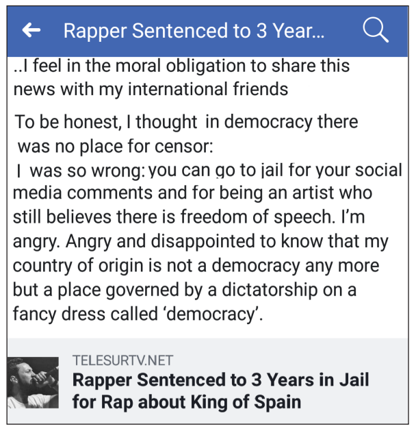
Figure 5: Luisa's post on Facebook (anonymised) voicing her opinion about Valtonyc's court case.