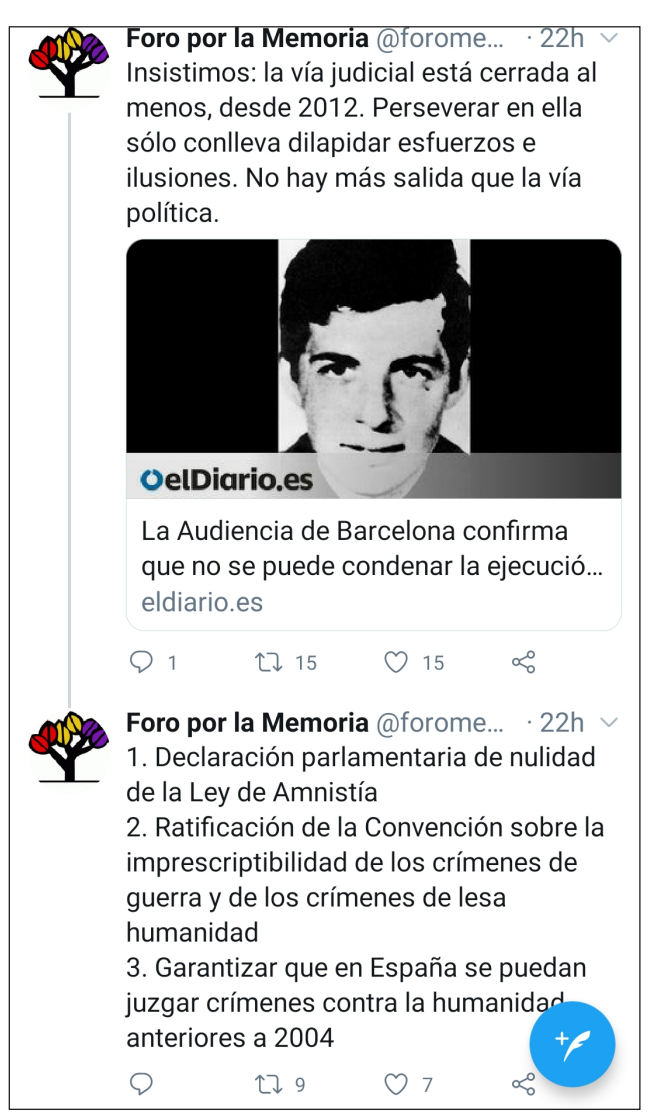
Figure 10: Foro por la Memoria's tweet concerning court resolutions. August 14, 2020. The caption reads: "We reiterate it: the judicial means are exhausted, at least since 2012. Persevering on it only entails dilapidating efforts and hopes. The only solution is political." The following tweet lists the necessary political steps to address this.

in response to a court resolution in Barcelona, arguing that the judicial remedies are now exhausted, and that only a political initiative can revert the Amnesty Law, which favours Francoist criminals. The association here argues for a declaration of Francoism as a period that could be judged for crimes against humanity by international courts. In this example, truth-making practices take place simply by stating that political intervention can indeed redress the institutionalised post-truth.<sup>6</sup>