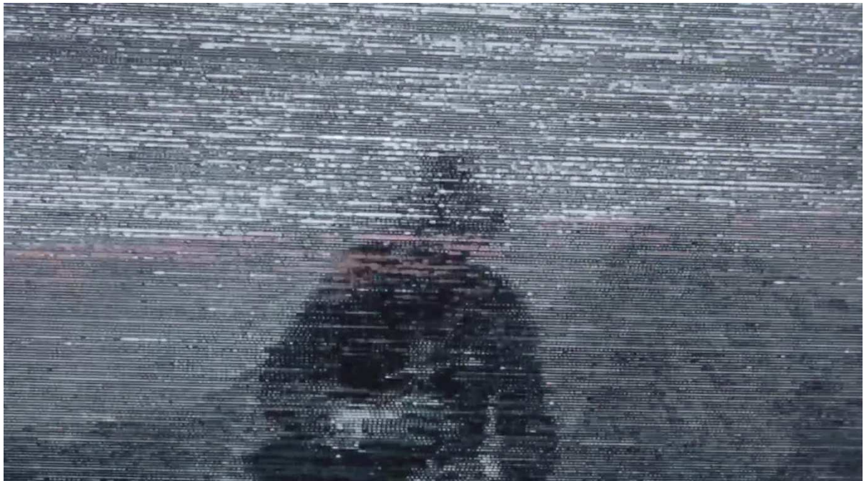
Fig. 2. Memorex Mori by Conflux Coldwell (2023)

noise of the media technology itself was a vital ingredient – this time I made it the primary focus. The work presented the flickering media ghosts as unidentifiable, as fatally-fading, as nearly absent, as the not-quite-alive, and as the soon-to-disappear completely.