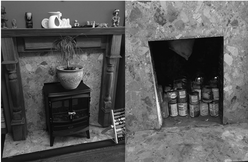
Figure 3. ‘Stash’ (tinned goods/bottles of water) hidden behind unused fireplace.

Paula’s account illustrates how norms of intensive motherhood are heightened when combined with prepping, creating new mothering responsibilities to protect their stash and keep their family safe. Paula devotes extensive amounts of time, energy and resources to prepping behaviours, which she sees as an investment in the family’s future safety and well-being: ‘it’s hard work, all this prep, and I don’t want to run the risk of my efforts and hard work going down the toilet’.