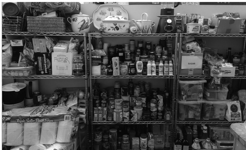
Figure 1. Purpose built storage area.

because we have no food? Are people going to think that I'm not coping?' Sarah's concerns regarding the imagined future consequences of not meeting expectations is reflective of the motherhood display literature (Dermott and Seymour, 2011; Finch, 2007). Being seen by others, particularly other women, as a 'good' mother was important for our participants, yet their prepping activities remained highly secretive and guarded.