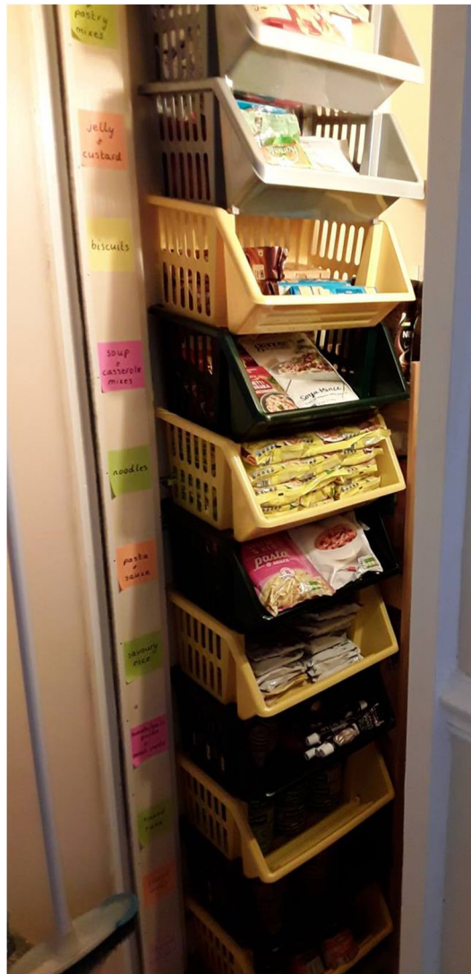
FIGURE 2 Carefully organized/labeled stockpile.

culinary skills and accumulated cultural capital to “ make the most ” of the two boxes of food that she managed to store under the stairs, on a restricted budget.