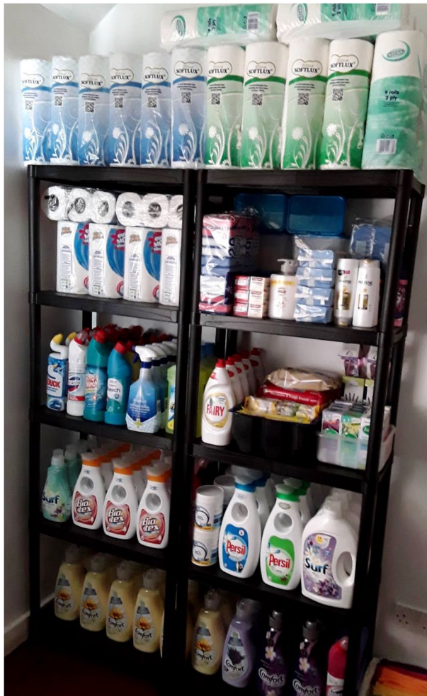
FIGURE 1 “Only one foot by four-foot floorspace used”.

Although online prepping forums were predominantly described as supportive spaces, participants acknowledged how they fostered competitive spirit with prepping prowess rendered synonymous with ‘good’ motherhood display (Harman & Cappellini, 2015). Failings as a prepper affected the women’s sense of competency as ‘good’ mothers. Carefully managed, grandiose stockpiles were interpreted by most participants as indicative of the love and attention that ‘good’ mothers transferred into their stash and displayed via prepper-porn as Jane (who had 6–8 months of food/water stockpiled) explained: