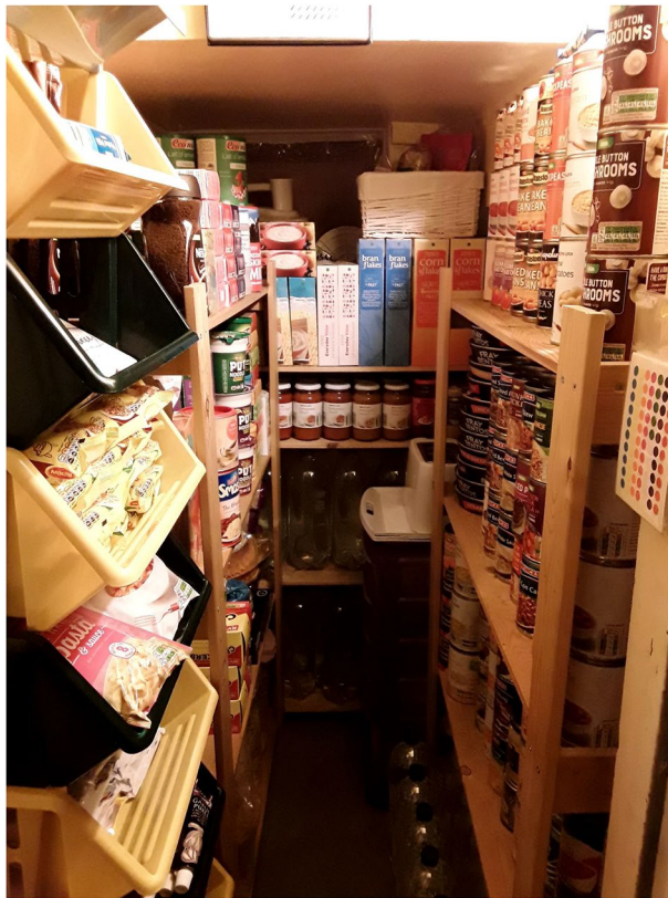
FIGURE 3 Under-stairs cupboard with goods neatly arranged.