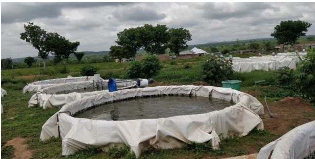
Plate 1: Fishponds by Bui Power Authority constructed at Bui Resettlement Township as part of the livelihood revitalization efforts.

BPA has been facilitating and supporting cage aquaculture production since 2019, an initiative to revitalize fishing activities in the resettled communities. At the time of the field work, the program had been implemented in Bui Resettlement Township, but, yet to start in the Jama Resettlement Township. It was reported that the BPA funded the construction of the fishponds and provided the first stock of fingerlings and feed for the cage owners. Examples of the fishponds are shown in Plate 1.