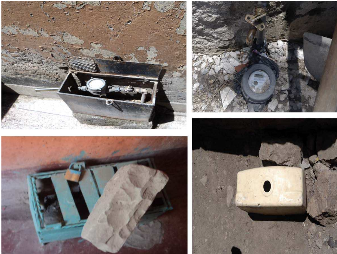
Figure 2. Reassembled metre installations. Clockwise, from top left: a caged water metre; a metre virtually buried in the ground; a metre hidden beneath a repurposed plastic container; and a caged and locked metre, further protected with a heavy stone on top.