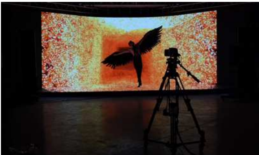
Image 2 - 'Icarus' by Northern Ballet using Production Park's LED volume

LED volumes harness volumetric capture technologies which allow tracking and synchronisation of cameras, lights and the virtual environments displayed on the LED panels. Video games engines are used to control virtual sets and environments and can be combined with sections of greenscreen for compositing other elements if VFX work is required in post-production. The majority of the VFX work with LED screens is captured in final-pixel in-camera,