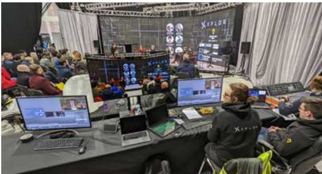
Image 1 - Production Park/Xplor's 'brain bar' and LED volume

We also attended two industry events which had a focus on virtual production. Following in person networking at these events, follow up emails were sent to the companies and individuals who had been approached during the shows. From these two recruitment strategies, we then snowball sampled additional participants.