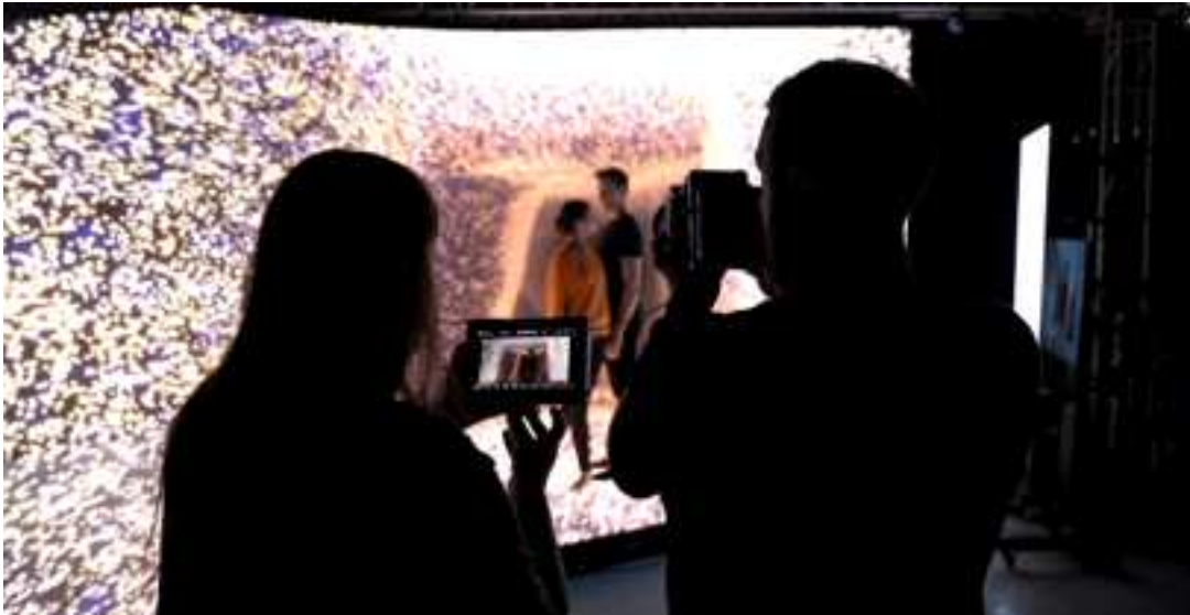
Image 4 - Northern Ballet using an LED volume at Production Park, West Yorkshire

young families and mums and getting back into work. I think that's a lot more achievable [with virtual production] because I completely get it if you're a young parent, you don't want to be travelling for three months leaving the baby at home doing all that kind of stuff. But if it's a [virtual production] studio 30 minutes down the road, that's just like going to work'