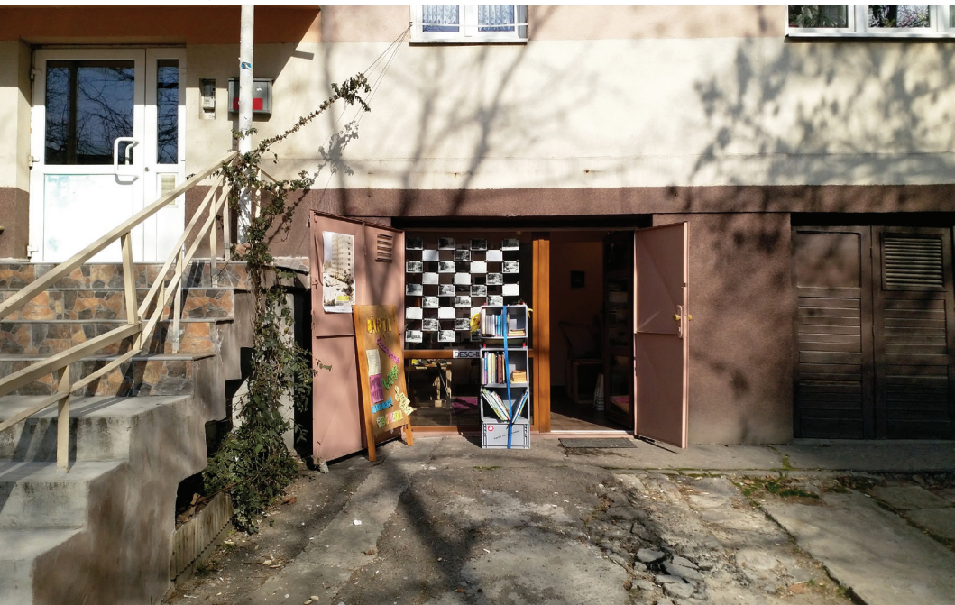
Fig.4: The Garage DESCHIS/ OPEN Garage space at the ground floor of a collective housing apartments building in "Buclă," Drumul Taberei, Bucharest.