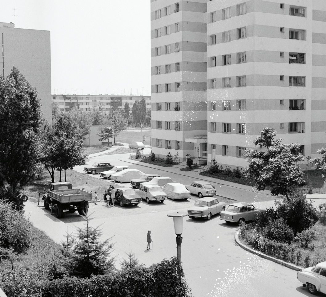
Fig.1: Typical inner courtyard, from Drumul Taberei Monograph (1973).

been built on city's outskirts. 6 As "an integral part of the labor economy," 7 the state-subsidized housing was a right for all. Taken off the market, housing became an asset for attracting workers to the city. This economic model favored the production of living units rather than the grid of public infrastructure. 8 As the initial utopian urban promises were found wanting, this failure turned out to be an opportunity for housing estates to be adopted and cared for by their inhabitants. Consequently, the dwellers hacked the planners' top-down universal model of dwelling and developed situated practices of living together.