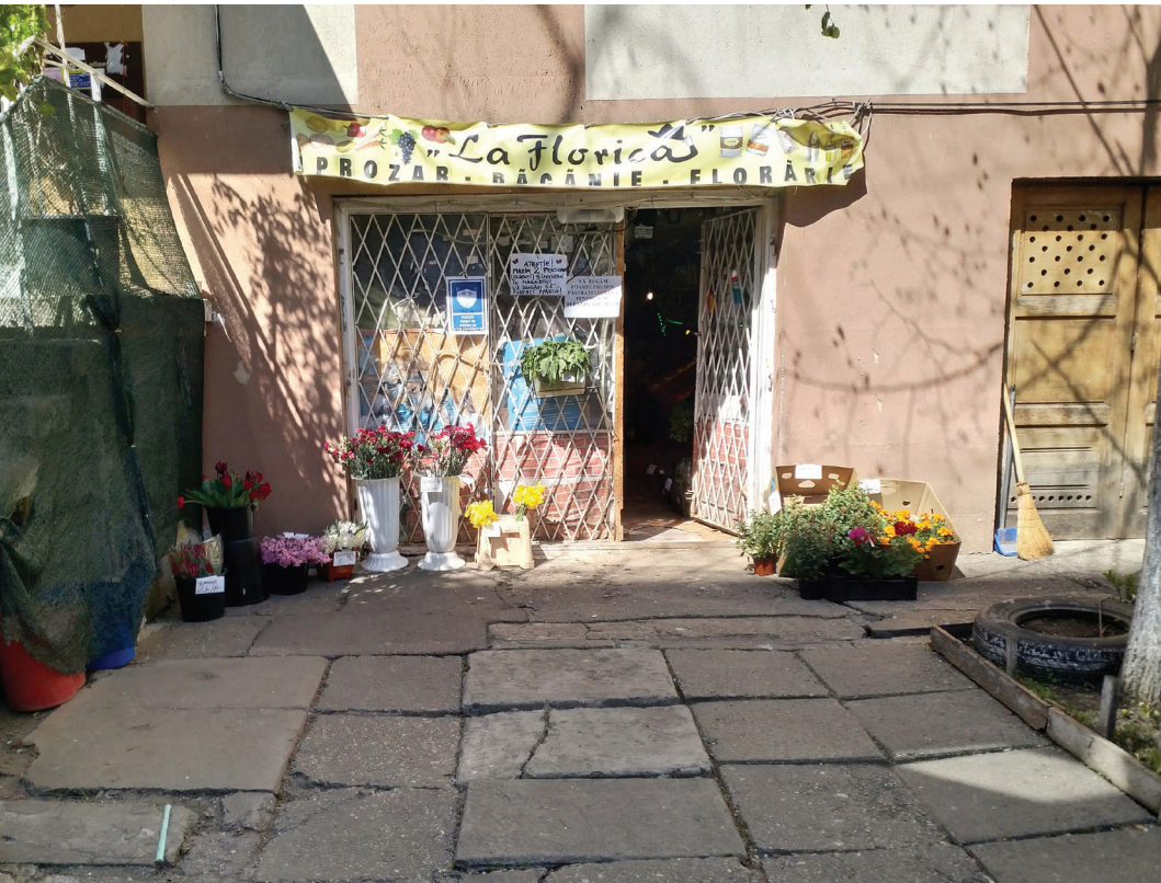
Fig.8: The open garage typology - inhabitants are turning garages into pantries, workshops, play and hobby areas, or opening small stores and service spaces, which became social hubs and local nodes.