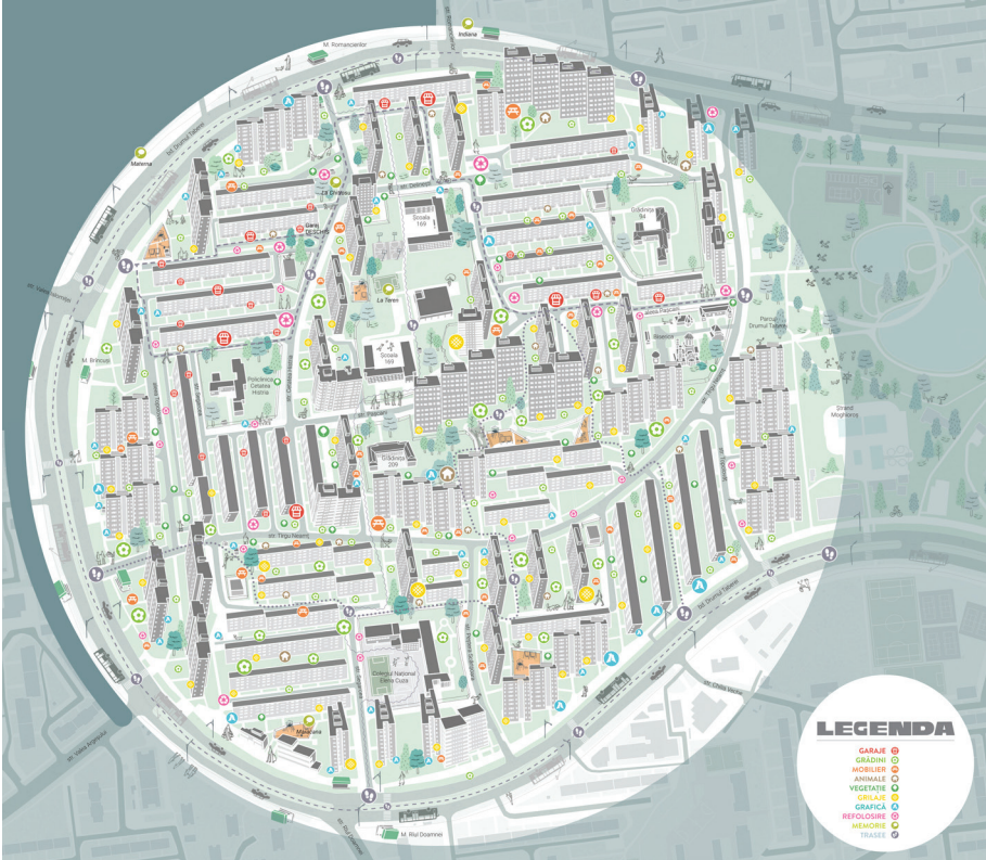
Fig.5: The Map of Collective Practices in “Buclă” consists of an inventory of typologies of collective practices of managing common spaces.