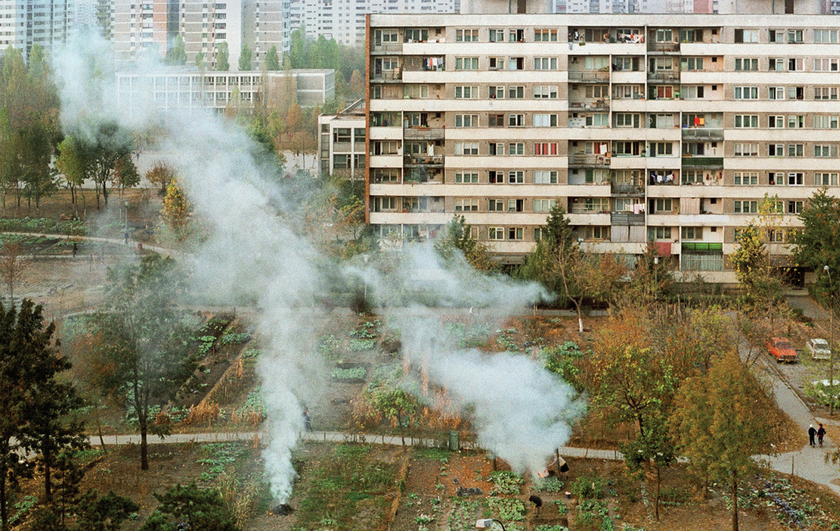
Fig.2: The care for green spaces gained momentum in the 1970-1980s, when encouraged by the legislation, the inhabitants set up gardens around their buildings and on individually allotted plots. Piața Moghioroș area, Drumul Taberei.

The ephemeral transformations of the in between spaces happened at scale. These housing districts became open air laboratories for collective living. Here, situated solutions were forged by the very inhabitants affected by these massive changes. After several stages of adaptations and adjustments, inherent to such “new town” type of housing districts built from scratch, abruptly populated and radically affected by systemic shifts, these areas have finally settled. Perhaps the spatial, as well as the civic generosity of the initial urban planning was the key feature which allowed the planned projects to become actual neighborhoods.