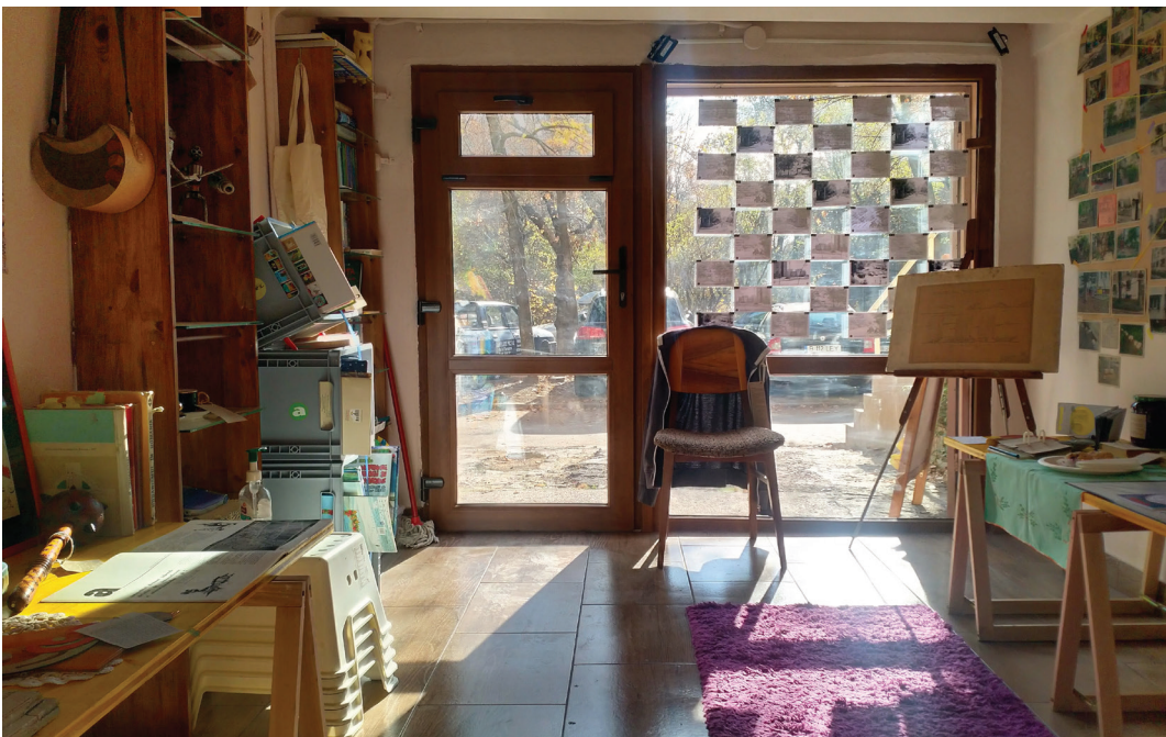
Fig.6: The “Drumul Taberei. OPEN Neighbourhood” exhibition spatialized the research results in the garage space, through photo, text and artwork installations.