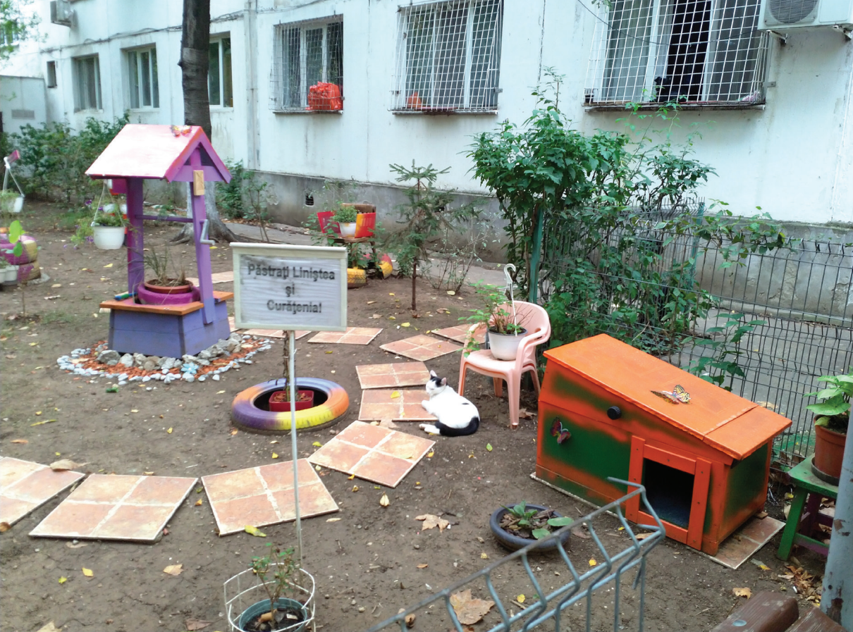
Fig.9: The showcase garden typology - inhabitants care for the spaces around the buildings, beautify them, use them for relaxation and socialization, becoming solutions during the pandemic.