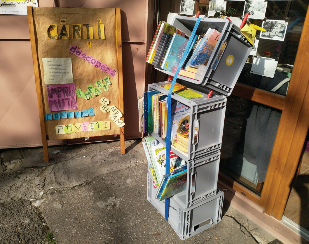
Fig.7: The Garage Library, with its mobile shelving, hosts a children's and youth collection, created from donations and exchange.