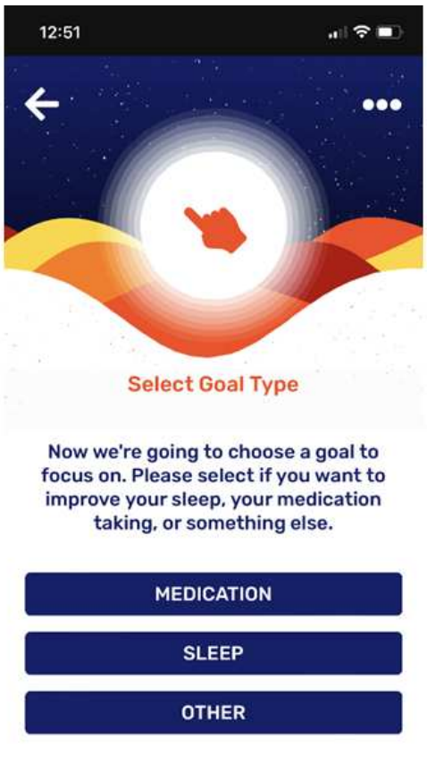
Figure 5. Goal types within the Change One Thing app.

workbook, then the participant or DIAMONDS Coach will record the goal in the goal-setting section of the workbook.