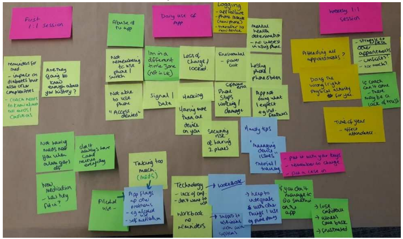
Figure 3. Solution-focused evaluation of the intervention components.