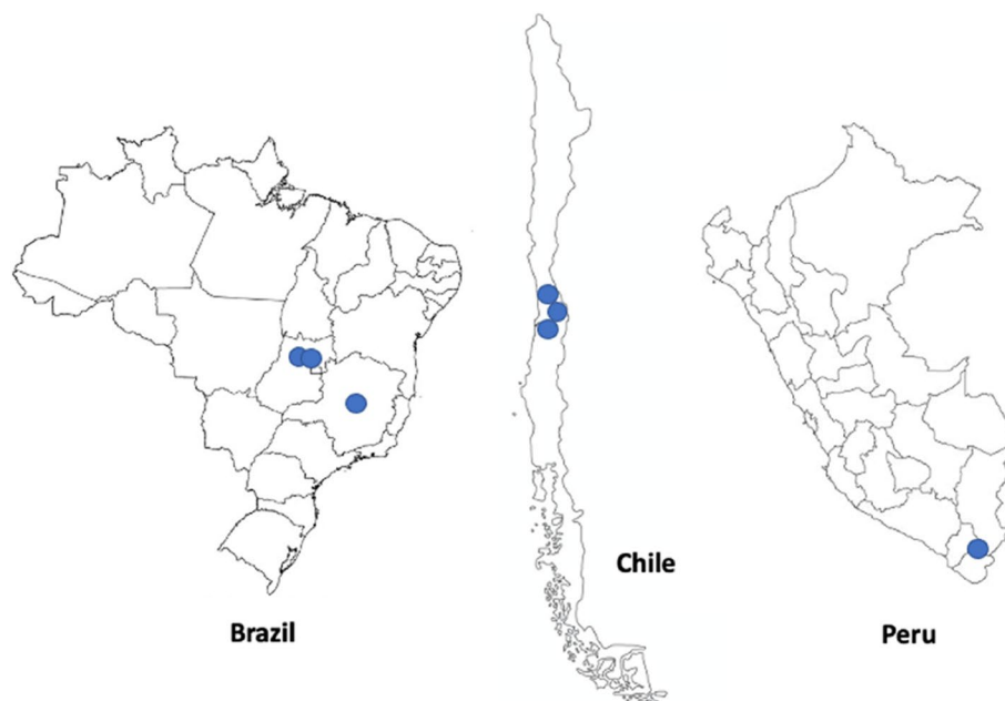
Fig. 1 Mine locations. Brazil: three mines located in the Federal States of Goiás and Minas Gerais. Chile: three mines located in the Valparaíso region and the Metropolitan Region of Santiago de Chile. Peru: one mine was located in the Mariscal Nieto province in the Moquegua region

in the countries were identified to form a Latin America research team within the consortium. In Peru and Chile, the partner was Innovation for Development, and in Brazil it was John Snow Brasil.