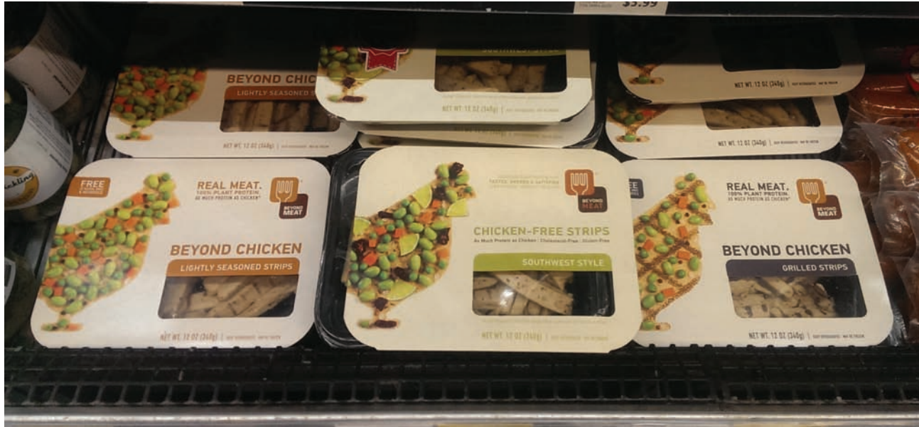
FIGURE 3: Beyond Meat products in a Whole Foods Market, San Francisco.