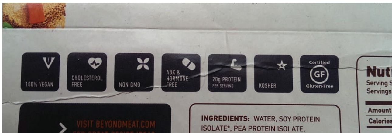
FIGURE 2: Section of labeling on the back of packaging for Beyond Meat “chicken” strips.