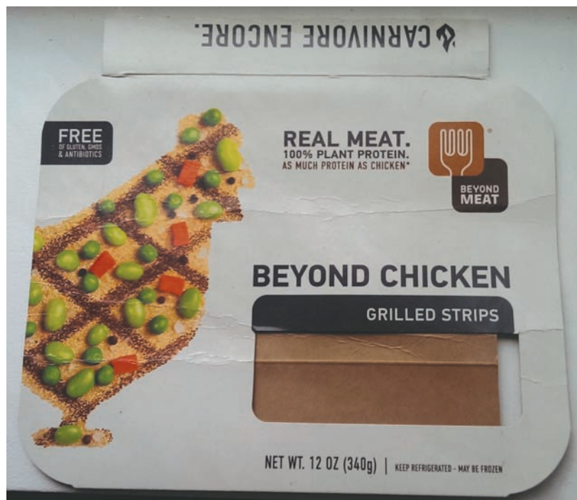
FIGURE 1: Front of packaging for Beyond Meat “chicken” strips.