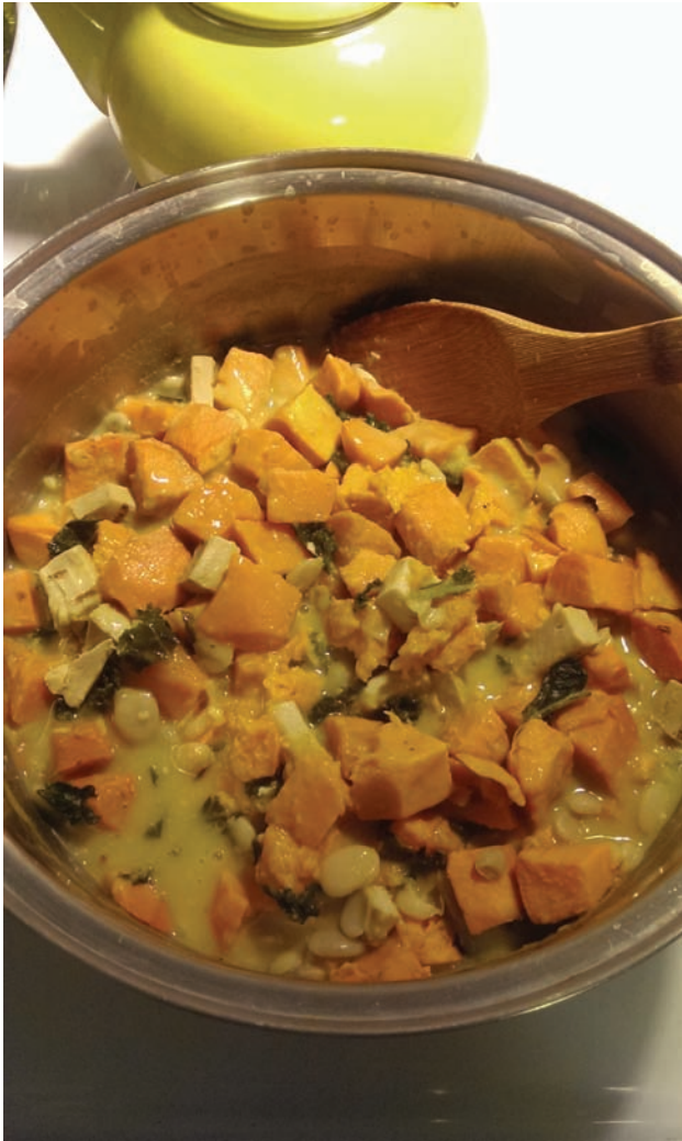
FIGURE 4: Cooking with Beyond Meat “chicken” strips during fieldwork.