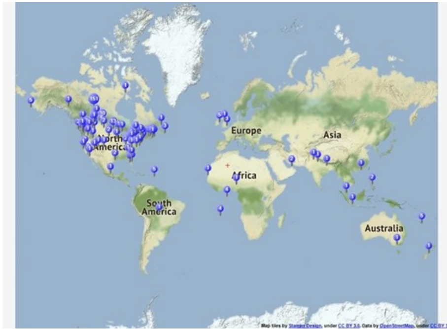
Figure 5: Geographic origins of 1,393 Twitter messages with a #SpeakingMoistly caption. These messages were posted between April 18 and by April 28, 2020.

In other words, what Tyler’s meme did was promote spreadability of a message via social media platforms (like YouTube, Twitter, Facebook, TikTok, etc.) and, after initial successes, via a licensed audio-only version of the song available from Spotify and iTunes. The relationship between audiences, memes, and Web 2.0 technologies is at the heart of that spreadability—and the meanings that emerged as messages traversed on- and offline spaces.