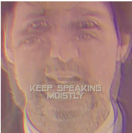
Figure 8: Cherry Tateland, “Keep Speaking Moistly” 112

Video link: https://doi.org/10.3998/mp.4571