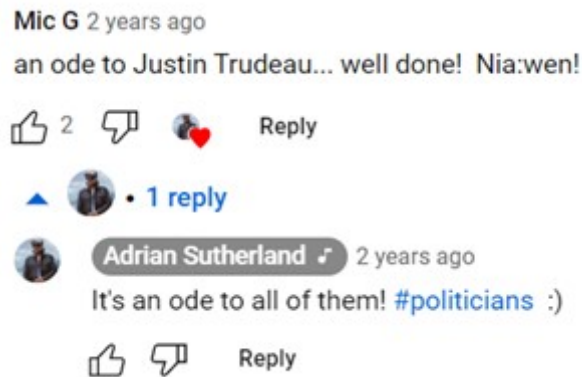
Figure 3: YouTube comments in response to “Politician Man (Official Music Video).” These comments were posted in 2021.

offering appreciation of positive feedback as well as gentle clarifications (see Figure 3). 82 The comments that curate “Politician Man” model Sutherland’s invitation to dialogue and refusal to play the “blame game.”