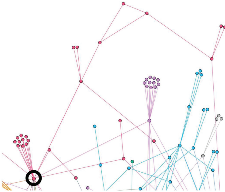
Figure 3. Extract from figure 2 of Hakluyt's sub-network; the node representing Hakluyt is circled.

of armes well-armed', '16,000 Janisaries', '1,000 pages of honore' and 'a companie of horsemen [...] to the number of foure thousand'. 43 This description served to remind the reader of the Ottoman military strength, while the rich fabrics recalled for London readers the 'Mediterraneo' of St. Paul's.