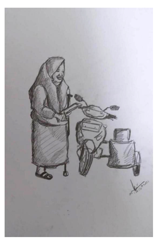
Figure 3. Rahimah and her a three-wheeled motorcycle, drawn by Rizaldi.

Rahimah and Fajar are also active in collecting data about diffabled people living in the city. There is no formal data available on the population with diffabilities, so they work voluntarily at the grassroots to identify people across the city, then leverage their networks in the private sector or government to try and source necessary support. During the worst floods, they help mobilise and distribute food donations. Rahimah rides a three-wheeled motorcycle (see Figure 3) that she and her husband personally modified so she can drive it with just