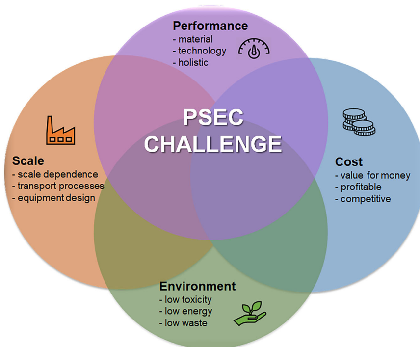
Fig. 1 The PSEC development challenge for sustainable and scalable enabling technology. Thorough multi-criteria thinking can be achieved via the PSEC development challenge (i.e. P erformance, S calability, E nvironment and C ost) which will help address specific barriers to commercial success.