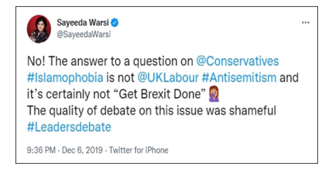
Figure 1. Tweet contesting Islamophobia.

(16.1%), racism in British politics (8.3%), and then anti-farright politics (6.2%).