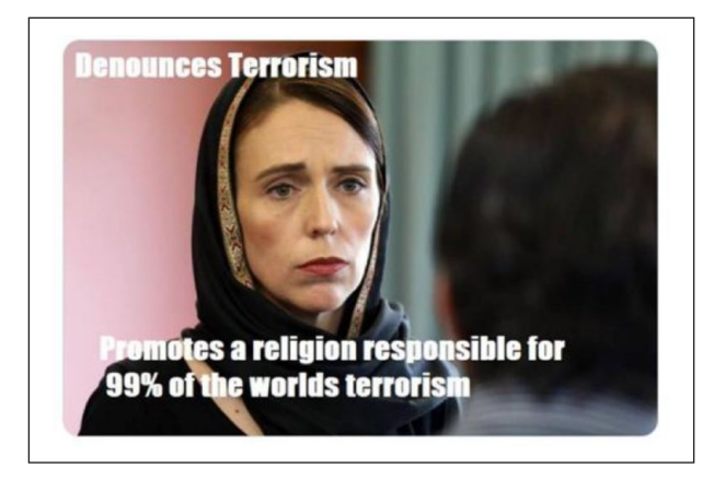
Figure 4. Meme shared by an anti-Muslim, pro-gun, pro-American account.

advance other right-wing agendas such as the censorship of content online (following the prosecution of users for sharing hateful content in New Zealand). These provoke a largely negative response, particularly from US users, as they seek to shore up support for the status quo in the States. The proportion of US users continues to be high in both June (28.8%) and September (30%) and demonstrates the continued appropriation of events by right-wing users for their own causes. Some of these pro-gun lobby accounts share memes that draw on anti-Muslim tropes to further their agenda, illustrated by Figure 4.