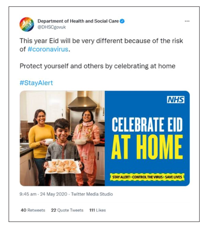
Figure 8. UK Government messaging during COVID.

Despite being a much more negative dataset, reflecting geopolitical flows on Twitter, it also shows the strong solidarity with Muslims in general whether that be non-performative, communal, or activist groups seeking to strategically challenge Islamophobia on Twitter. The rise of Islamophobic social media content from the Indian subcontinent has been noted by numerous studies (Awan & Khan-Williams, 2020; Ghasiya & Sashara, 2022; Rajan & Venkatraman, 2021). It is interesting that the pattern of prejudice is reversed in this dataset where the initial reaction of the far-right leads to intensely negative tweeting which gives way to a more positive "long tail" effect over time. It appears that the serious and sustained negativity generated by the event, particularly in India, has given rise to a more sustained, strategic effort to combat it.