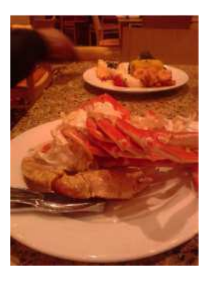
Figure 4: "Buffet."

"I felt like taking this photo that evening that I was eating for the first time at a buffet in the casino. In Mexico, when would you ever eat these luxury foods? Well, every once in a while