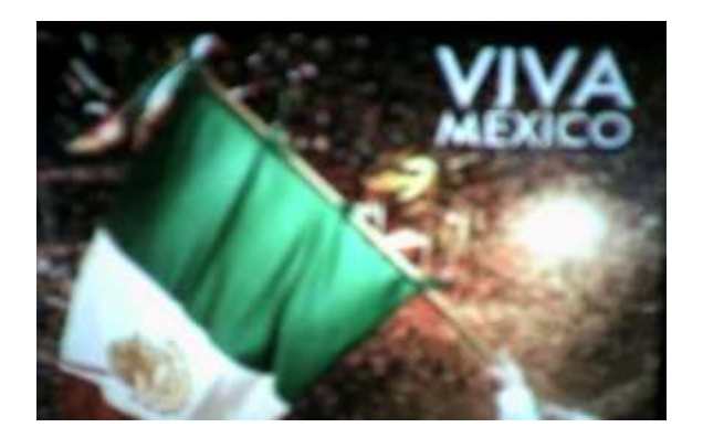
Figure 7: "Viva Mexico."

We initially assumed that the lack of quality in some photos (dark, blurry or moved,) was due to the fact that participants wanted to use the images as representations of something else. However, as opposed to our hypothesis, the majority of low quality pictures (see Table 2) were used to express literal interpretation (36%) and add context (24%). Add representation or meaning came third (19%). It is important to clarify that categories were not exclusive; it means that in some cases the participant started its interpretation by describing what was on the photo and