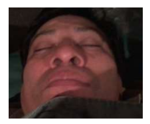
Figure 5: "American Dream."

Here is an example of a photo taken by a participant in Seattle (Juan,) which description adds meanings to his photo: