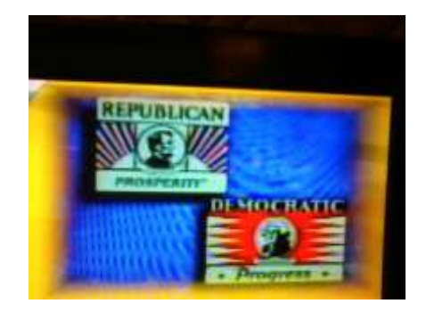
Figure 2: "Main Political Parties."