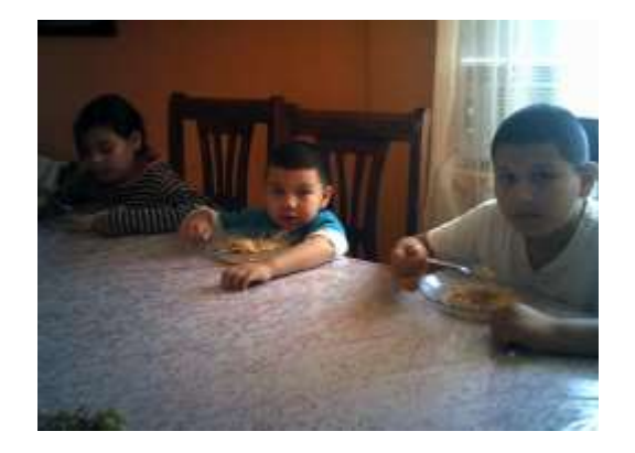
Figure 1: "Kids having lunch."

The results of our analysis show that, in Fotohistorias , the interpretations provided by participants were mainly of two kinds: they either reaffirmed the content of the photos, or they added details on context, representation, or feelings to them. The following sections will detail these two kinds of interpretation.