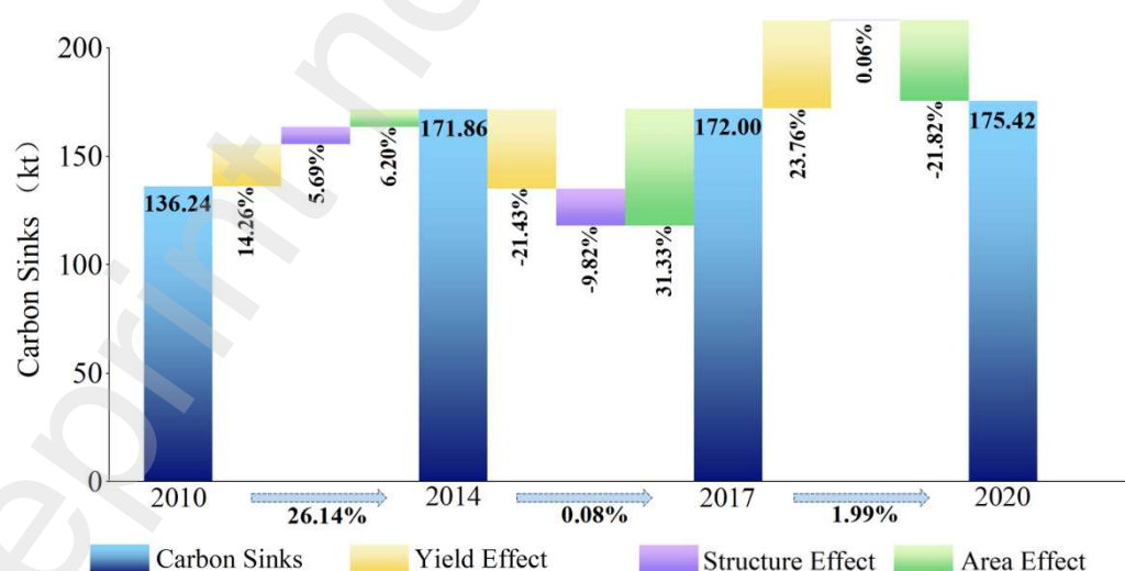
Fig. 2. Contribution of different driving factors to carbon sink changes in Shandong Province (2010-2020) (kt). The intensity effect ( \Delta I ) is set to 0 and not shown in the figure.

Between 2010 and 2014 all three factors, i.e., yield, structure, and area, contributed to a rise in carbon sinks, resulting in a 26.14% increase in the carbon sink of algae relative to 2010. The yield effect stood out as the primary cause for increased carbon sinks (contributing 14.26% of the increase). Between 2014 and 2017, carbon sinks only increased by 0.08% based on the 2014 level, and the effect of area became the major contributor to increased carbon sinks (53.84 kt, 31.33%). In contrast, yield and structure showed inhibitory effects, resulting in a 21.43% and 9.82% reduction in carbon sinks, respectively. Between 2017 and 2020, the yield effect (40.87 kt, 23.76%) contributed positively to carbon sink growth, which was mostly offset by the negative effects of area (37.53 kt, 21.82%), resulting in only a slight increase in algae derived carbon sinks (1.99%). Meanwhile, the structure effect had little impact on carbon sinks (0.10 kt, 0.06%). The driving factors for N and P removal from mariculture algae in Shandong Province were similar to those found for carbon sinks (Fig. S1).