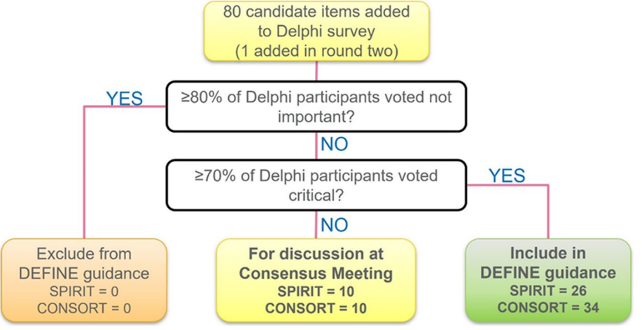
Fig. 1 Criteria for dropping items between Delphi survey rounds as well as automatic inclusion in checklists

To ensure that the Delphi survey participation reflected the landscape of EPDF trials, key multidisciplinary stakeholder categories, including clinical trial researchers, regulators, ethics committees, journal editors, funders and patient and the public, were defined (see Additional file 4) [10]. Potential participants in EPDF trials were provided with participant information sheets and invited via email to participate in the Delphi survey. They were identified through a wide range of platforms, including targeted mailing lists of professional groups (including UK Experimental Cancer Medicine Centres, UKCRC Registered CTU Network, Adaptive Design Working Group and Statistical Analysis Working Group of MRC-NIHR