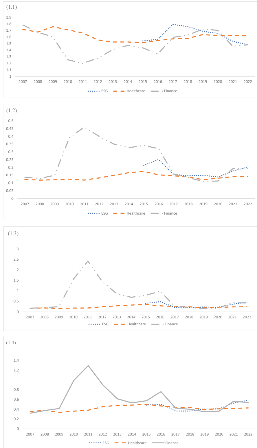
FIGURE 1 The rolling tail risk of environmental, social, and governance (ESG), healthcare, and financial exchange-traded funds (ETFs): (1.1) rolling tail index of ESG, healthcare and financial ETFs; (1.2) rolling tail quantile of ESG, healthcare, and financial ETFs; (1.3) rolling expected shortfall of ESG, healthcare, and financial ETFs; (1.4) rolling expected shortfall conditional upon 25% threshold of ESG, healthcare, and financial ETFs.