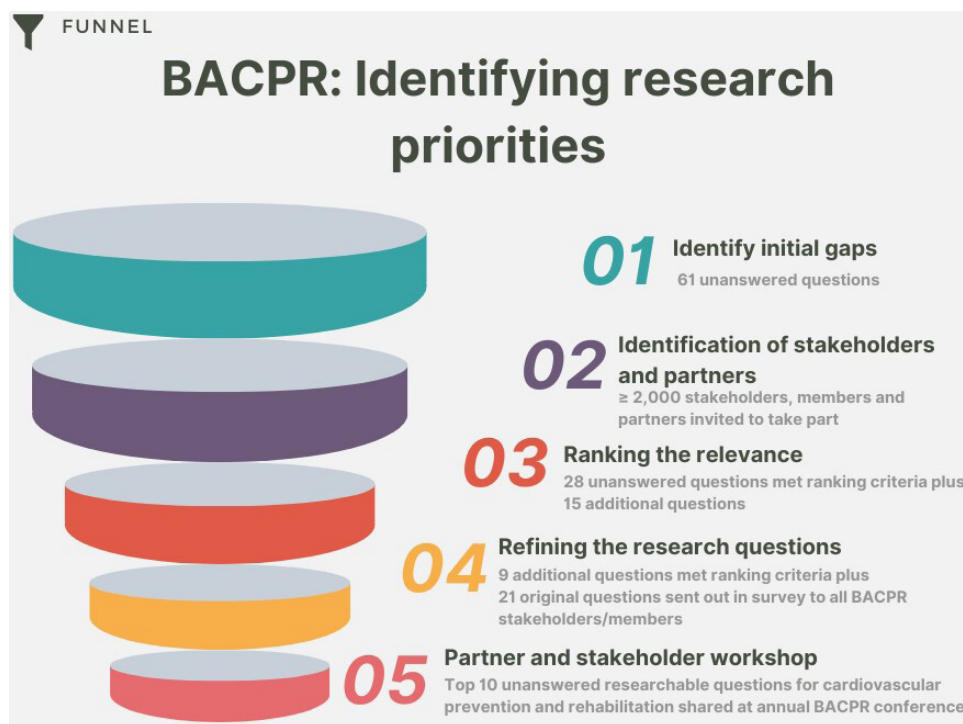
Figure 1 Summary of the findings from the five-step process. BACPR, British Association for Cardiovascular Prevention and Rehabilitation.

After refinement of these questions, a total of 30 questions (online supplemental appendix 2) were carried