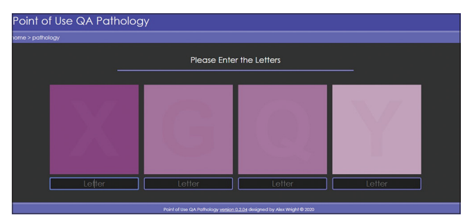
Figure 1: A Point of Use QA for pathology (POUQA).<sup>[11]</sup> The image above is for illustrative purposes only - the live link in appendix B should be used to test displays

A digital pathology system comprises several elements from the image stored on the digital pathology storage system,