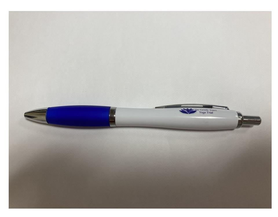
Figure 1. GYY SWAT Pen.

Both a pen and the cash note were enclosed within the recruitment pack for the host trial.