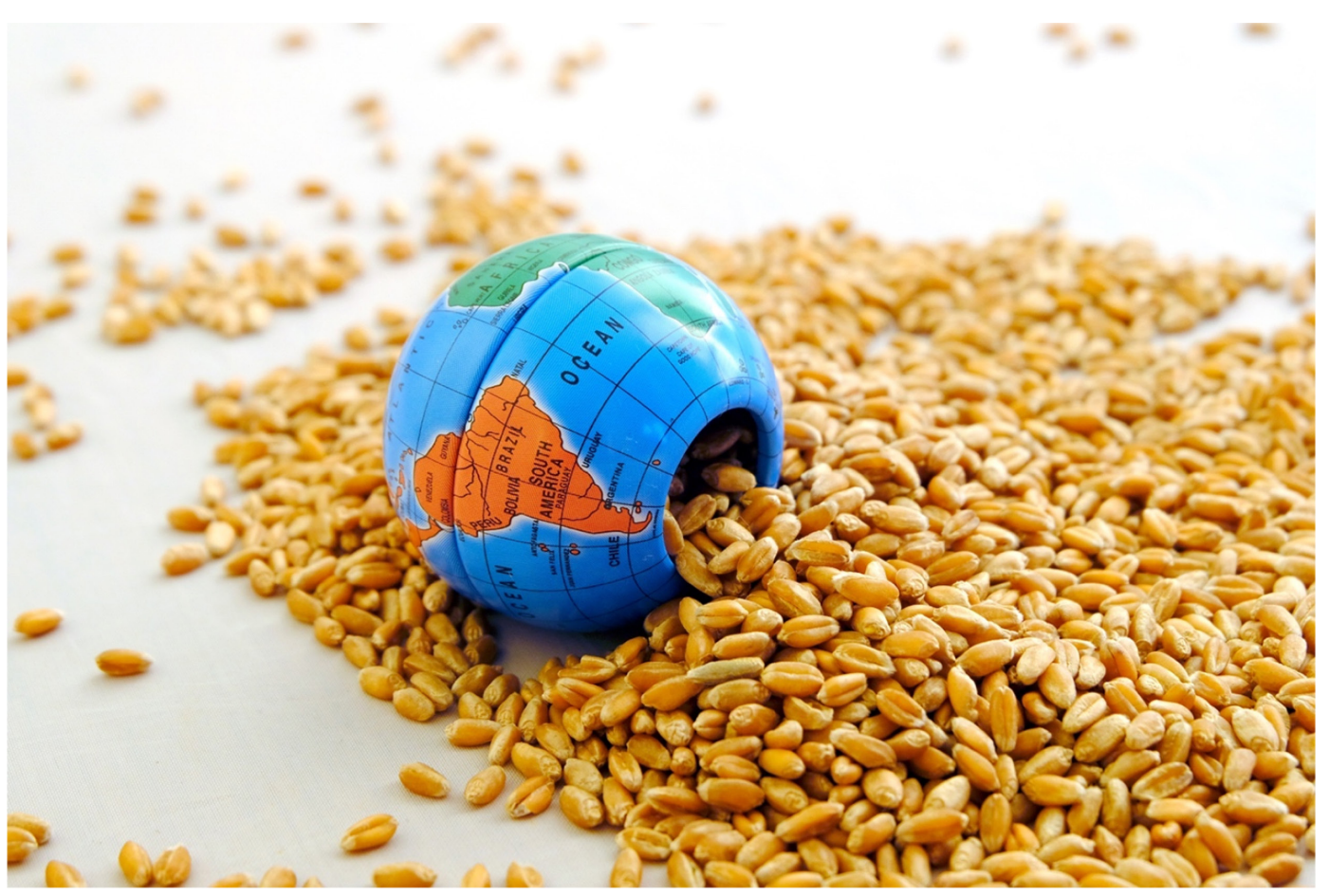
The Ukraine-Russia conflict has instigated significant cascading impacts on global food supply chains

implications and cause civil unrest, as seen during the 2007/08 financial crises in Cameroon, Burkina Faso, Sri Lanka and Côte d'Ivoire amongst others. Egypt and Yemen may be particularly vulnerable to such impacts due to their heavy reliance on imports of Ukrainian and Russian grain. Prior to the conflict, 6 million tonnes of agricultural commodities per month were exported from Ukrainian Black Sea ports. The UN and Turkey recently negotiated a deal with Russia to reopen the Black Sea trade routes to export wheat and foodstuffs from Ukrainian borders allowing the WFP to resume the purchase, transport and distribution of wheat. As of 5 December 2022, five maritime shipments containing wheat have left Ukrainian ports to aid humanitarian operations in countries such as Ethiopia, Yemen, Somalia and Afghanistan (European Council, 2022; WFP, 2022).