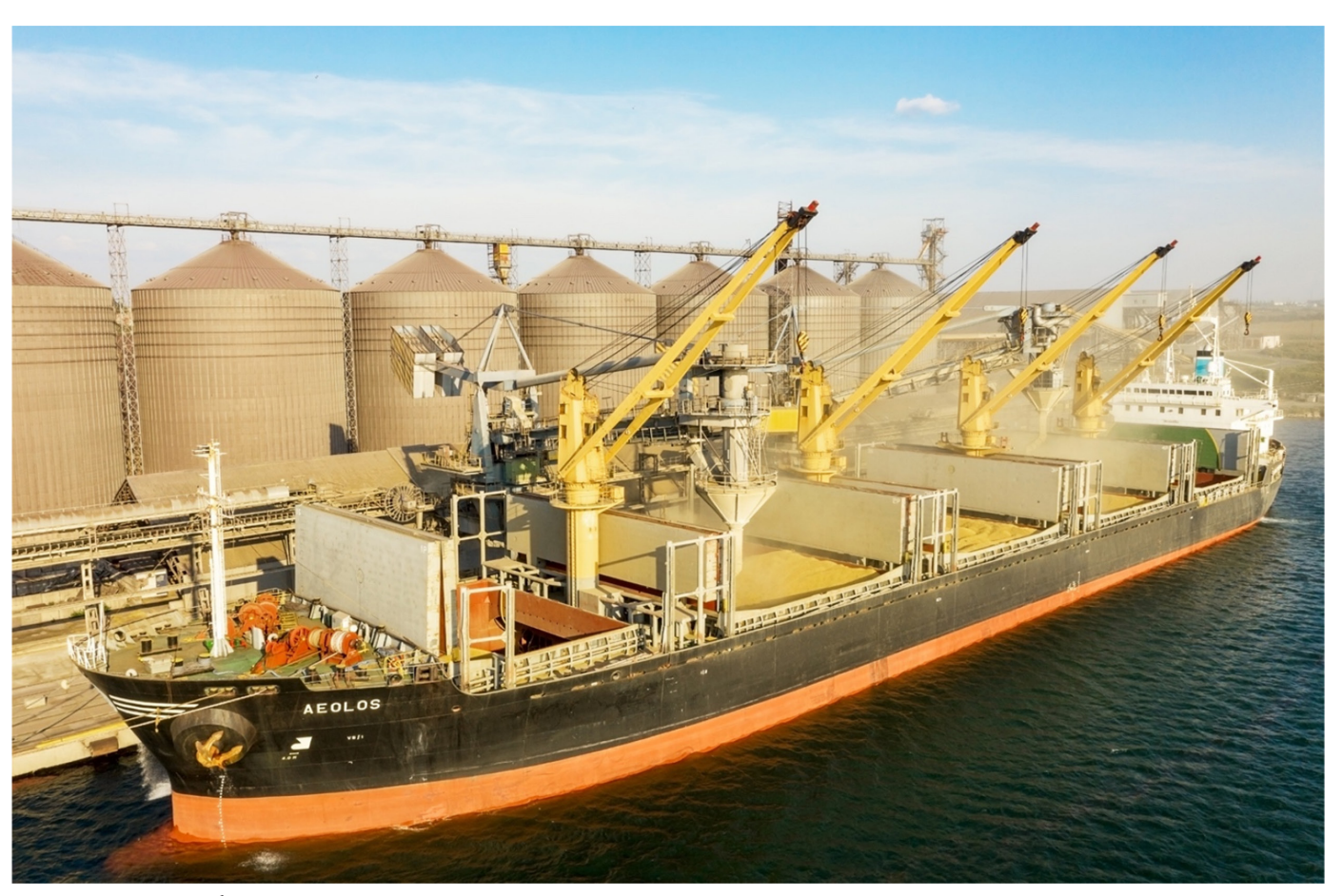
Prior to the conflict, 6 million tonnes of agricultural commodities per month were exported from Ukrainian Black Sea ports, such as Odessa

become undernourished in 2022 (FAO, 2022c). In wealthier countries, food price increases will lead some people to turn to more obesogenic diets which are often more affordable, exacerbating diet-related health inequalities. However, low- and middle-income countries will experience the greatest impacts on nutritional security due to their limited economic resources, with malnutrition expected to result in a short-term increase in death rates in these countries. Severe acute malnutrition already kills 1-2 million children each vear. Currently an additional 47 million people are at risk of starvation with children the most vulnerable to severe acute malnutrition, which will result in an inevitable spike in child mortality. Hidden hunger and micronutrient malnutrition get less attention than hunger because it is largely invisible; children, women and girls of reproductive age will bear the brunt as they are disproportionately more vulnerable to micronutrient malnutrition than the general population due to their greater need for specific nutrients (Osendarp et al., 2022).