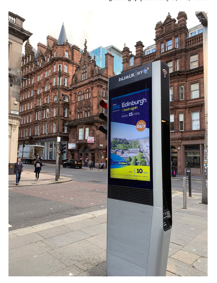
Fig. 2. InLink in Hope St in Glasgow City.

The introduction of these smart street furniture devices was inextricably associated with aspirations in the technology sector and local governments to transform urban spaces into 'smart cities'. In the decade leading up to their introduction, businesses and governments participated in events and read promotional texts emphasising the role of information and communication technologies in future urbanism. Smart