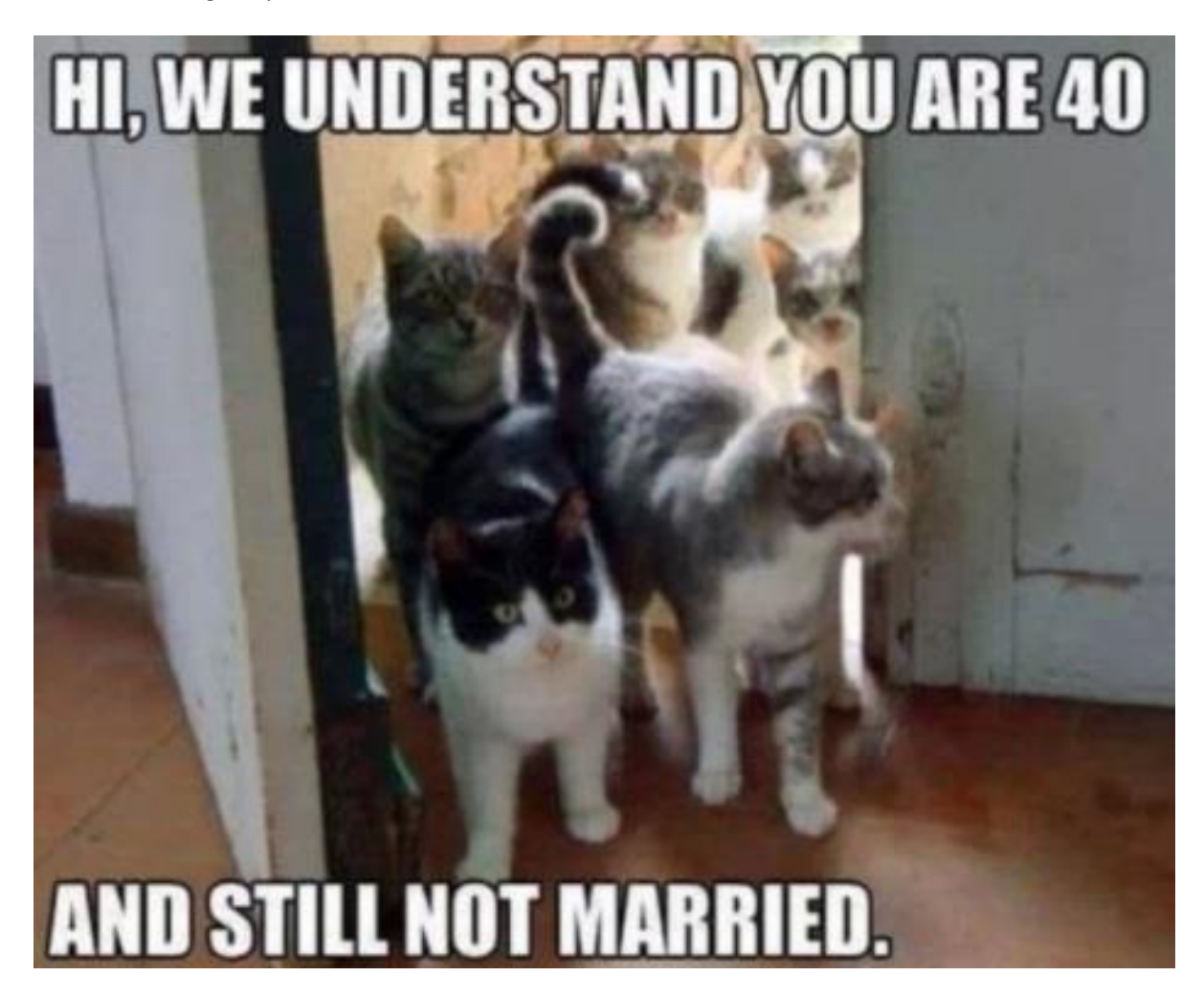
Figure 4 Photo 27 brought by Hannah

Hannah used an analogy to depict the pressure she felt from "people" who she portrays as measuring success in ways she resists, bringing a humorous depiction of the social pressure she experienced. However, although she expressed disagreement with the social value placed