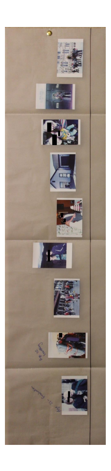
Figure 3 Avril's timeline

At 28, Avril felt she was behind age-related expectations, yet that it was not too late for her to catch up. However, she was unable to make crucial decisions in the midst of perceived time pressures and this created a feeling of being stuck and in crisis.