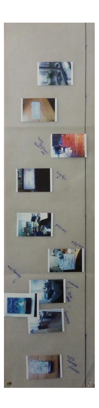
Figure 1 Olivia's timeline

The lead researcher (first author) met with interested participants in two sessions. In the first meeting, details of the study were discussed, and essential guidelines were provided for collecting photos, and in the second meeting, the photo-elicitation interview was conducted. In the period between the two meetings, participants were invited to collect and send images related to their difficulties of "finding one's place in the world." They had the option to take new photos (with consent from people), bring old photos or download images from the internet (as long as they were from copyright-free sources). An instruction sheet was provided to the participants containing guidelines for taking and/or collecting photos/images. Photos that had identifiable people/objects (including the participant) were anonymised before storing and using for publications. Interviews were audio-recorded with consent, conducted by the first author, and driven by the images brought. Participants used both verbal and visual means to share their experiences while placing the images on a timeline they had drawn (e.g., Figure 1).