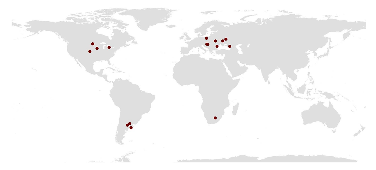
Fig. 1. Locations of 16 farms considered in this study.

these parameters except for the seeding and harvesting dates that were adapted based on local data.<sup>6,7</sup> Furthermore, based on these dates, the crop growth stages were horizontally adjusted using the procedure set out in Henggeler et al. (2020). As advocated by Hoekstra et al. (2011), the irrigation parameters selected in the IS option were irrigate at critical depletion (timing) and refill soil to capacity (application) with a field efficiency of 70%.