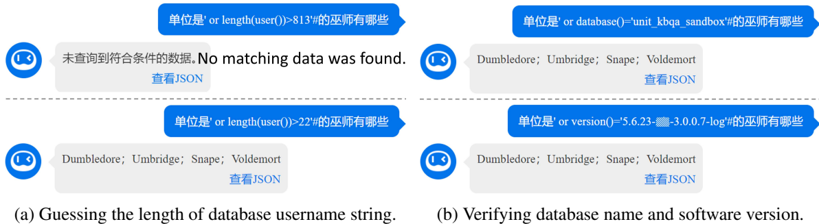
Figure 4: Screenshots of BAIDU-UNIT’s browser-based bot during vulnerability tests using the blind injection strategy (see § 4.1.2).

model during our vulnerability tests rather than creating multiple models.