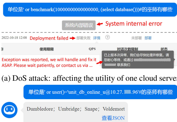
(a) DoS attack: affecting the utility of one cloud server.