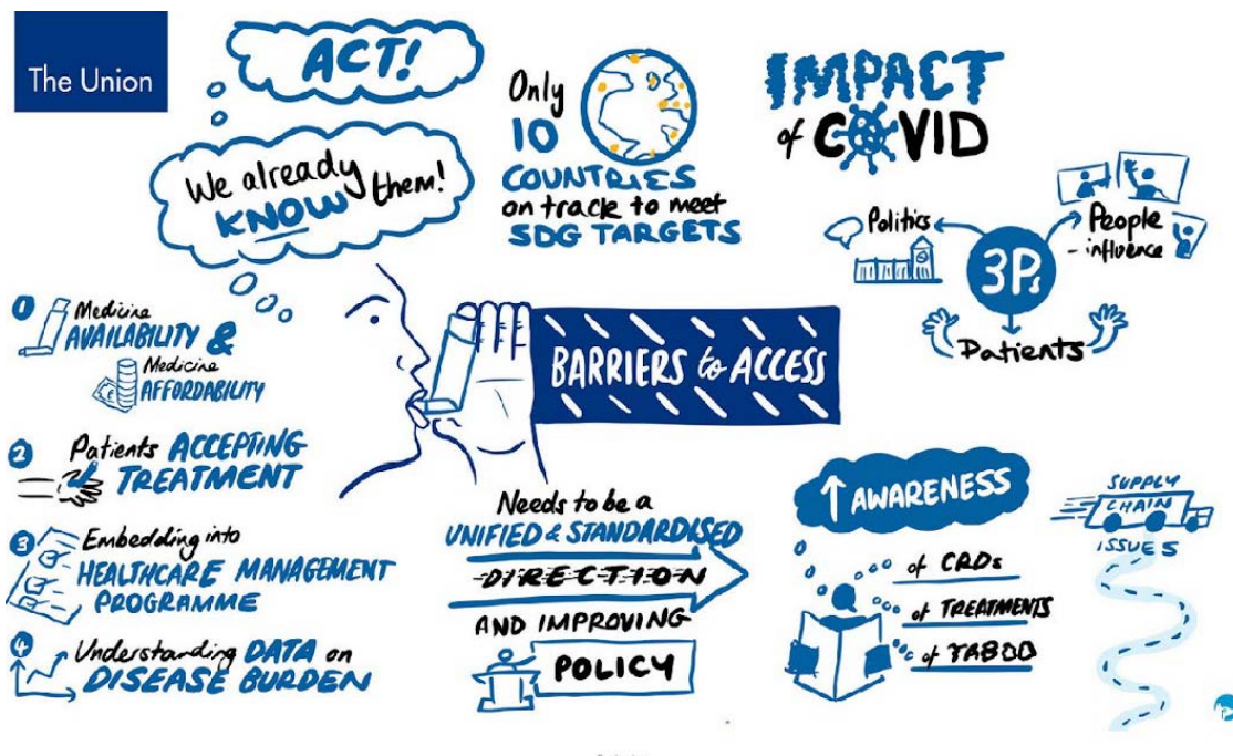
Figure 2 Visualisation created during the meeting: discussion of barriers. SDG = Sustainable Development Goals; CRD = chronic respiratory disorder.

patients as being a barrier to receiving effective treatment.