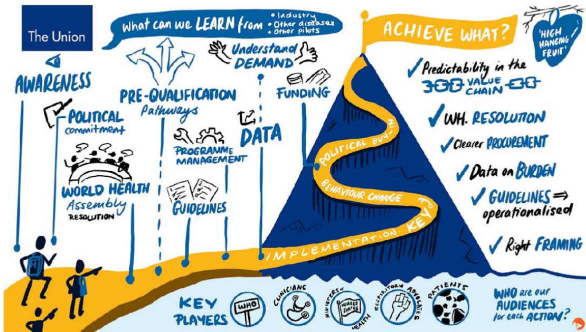
Figure 3 Visualisations created during the meeting: discussions about solutions.

replicable to other healthcare setting and contexts. Global organisations, academic institutions and industry would be key in providing the infrastructure for this. Updated guidance for LMICs, e.g., the WHO package of essential NCD (PEN) interventions for primary health care, could be used, although new evidence about more effective and safer strategies than those used in the past should be adopted. Lessons from previous projects, such as the Asthma Drug Facility, should be shared. There also needs to