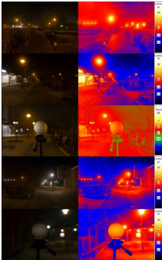
Figure 4. HDR-images with corresponding luminance measurements in Lindeborg square, from the top: