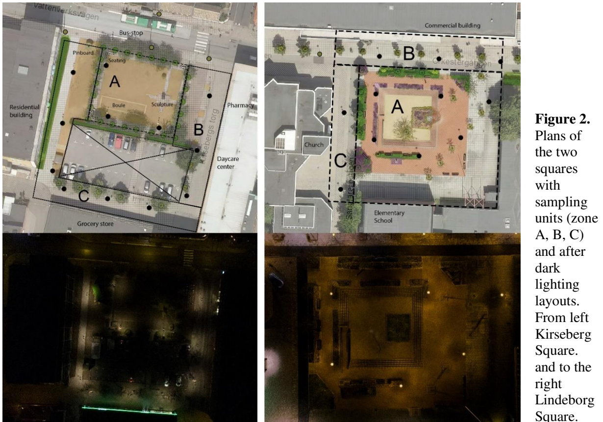
Figure 2. Plans of the two squares with sampling units (zone A, B, C) and after dark lighting layouts. From left Kirseberg Square. and to the right Lindeborg Square.

as a ‘social’ area with seating, B is a pedestrian and cyclist path with access to commercial shop(s) and other services(s) and C is a path linking the surrounding residential areas of the neighbourhood to its local square. A sampling session of 45 min enabled 3 rotations between the sampling units, with one rotation every 15 minutes always starting in sampling unit A, continuing to B and hereafter to C.