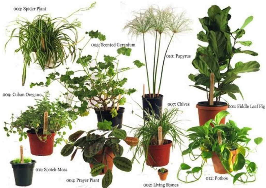
Figure 4. Picture of the plants that were given voices according to personalities inspired by their biological characteristics