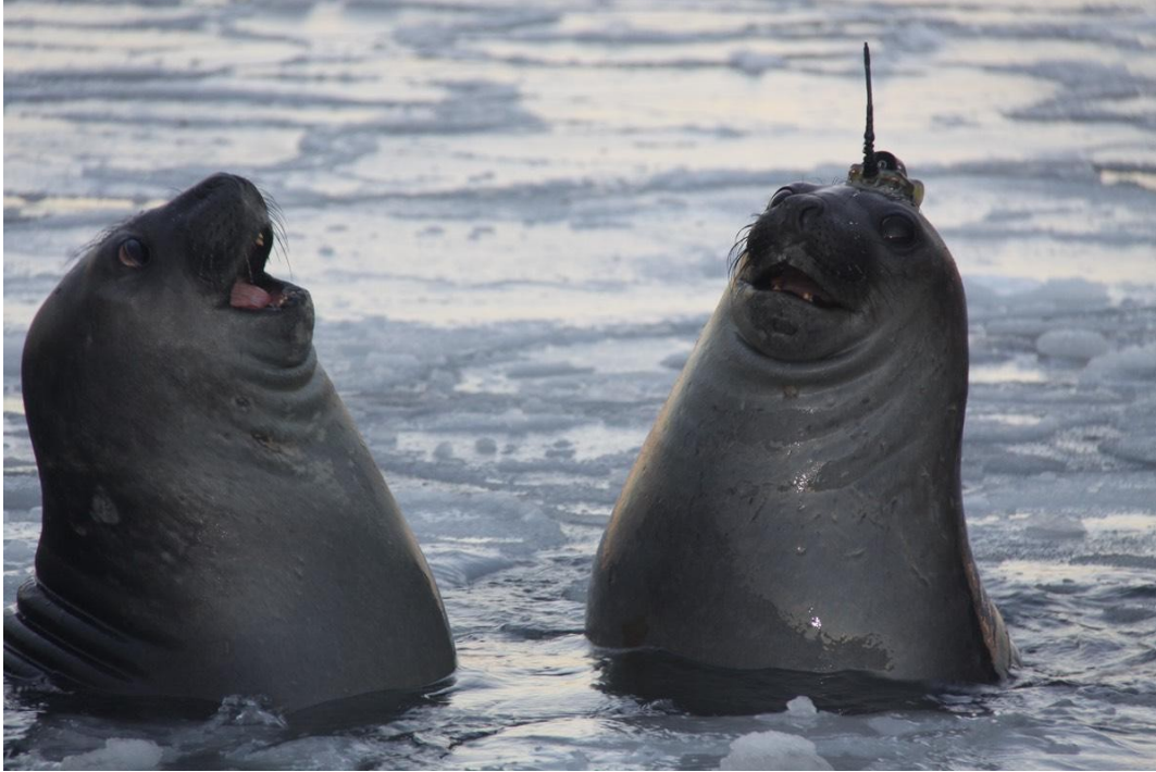
Figure 3. Two elephant seals, one with a sensor/transmitter.