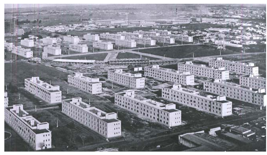
Figure 2. Los Perales housing complex, City of Buenos Aires, opened 1949.