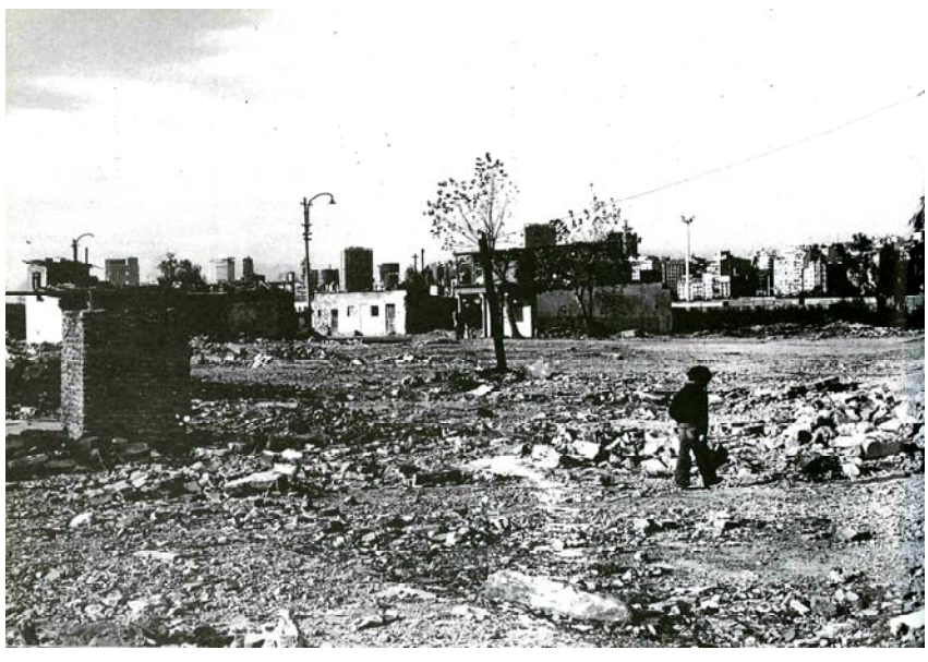
Figure 3. Shantytown 'eradications' circa 1977.