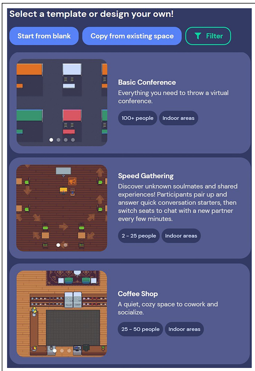
Figure 1. Three examples of the variety of pre-designed ‘maps’ available to educators to directly use as their learning environments, or to customize to suit their teaching needs (screenshot taken from Gather. Town, 2022 [ https://gather.town ]).