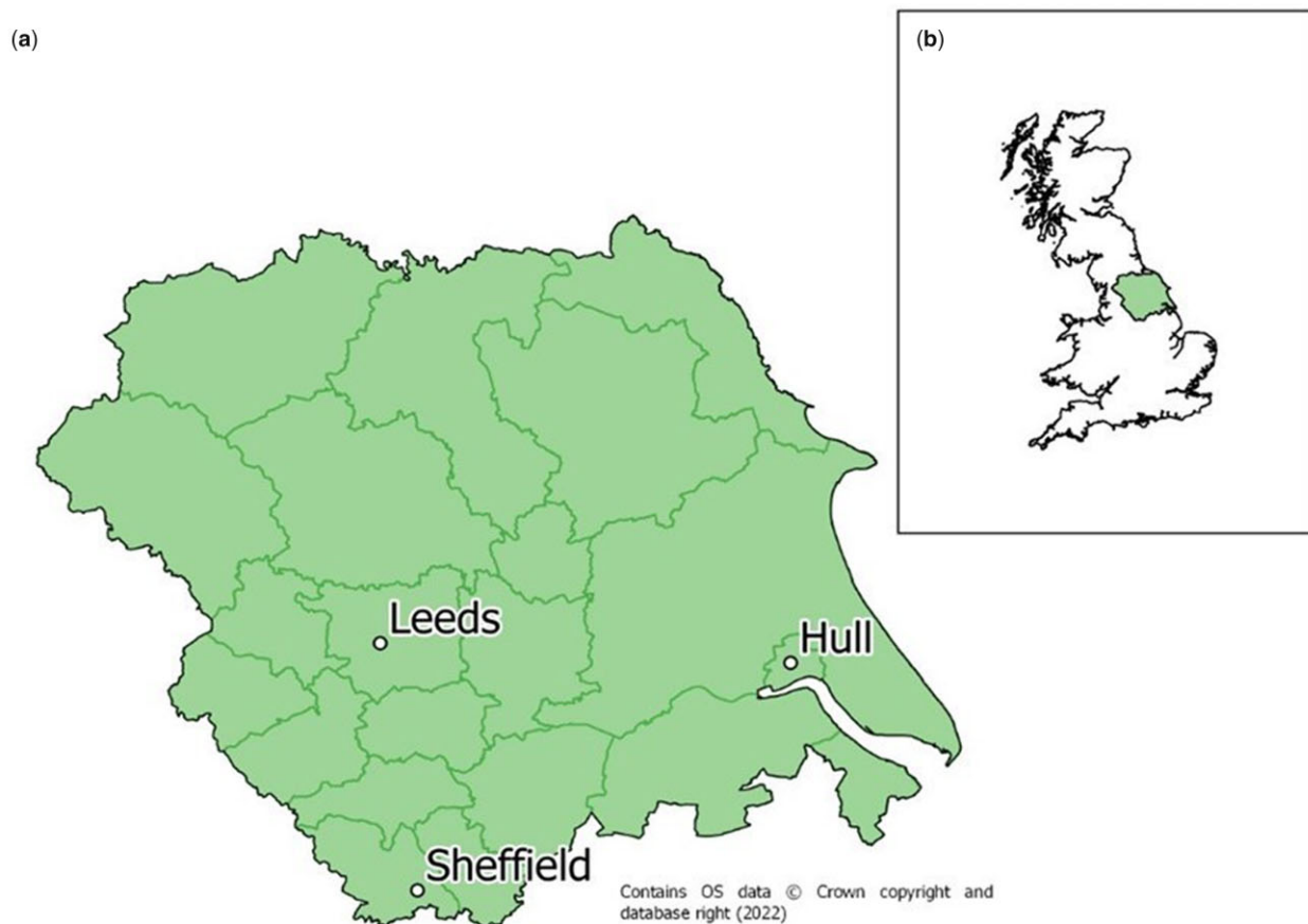
Figure 1 Yorkshire Specialist Register of Children and Young People (Yorkshire Register) population coverage. (a) Map of Yorkshire & the Humber; (b) map of the UK with Yorkshire & the Humber highlighted.

teenage and young-adult multidisciplinary teams at LTHT and Sheffield Teaching Hospitals NHS Foundation Trust. For all other ages (25–29 years), the primary source of notifications is NCRAS. An electronic feed has been established from local hospital patient management and pathology systems [including Patient Pathway Manager (PPM) 18 in Leeds, with a view to expand across all NHS Trusts across Yorkshire], as well as NCRAS 5 to improve the efficiency of the Yorkshire Register data collection. The Neuropathology department at LTHT provides an additional secondary source of notifications for all 0- to 29-year-olds referred for diagnosis and/or treatment and the Haematological Malignancy Diagnostic Service for all haematological tumours (Figure 2). Where essential data on cancer diagnosis and treatment are missing or incomplete from the electronic data sources, information is manually abstracted from local hospital notes and patient management systems. Yorkshire Register data are cross-checked annually and validated against other data sets held by the NCRAS 5 for the purposes of quality assurance.