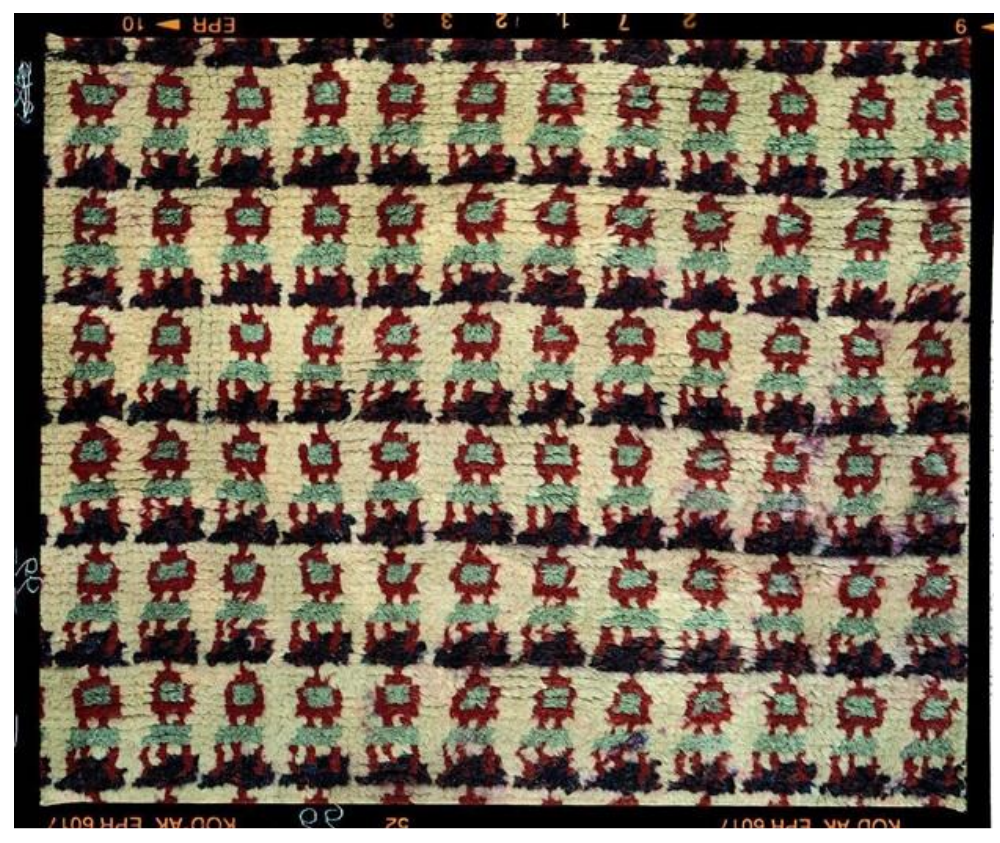
Fig. 4. Gio Ponti, Chairs Rug, 1935, Knotted Wool, 195 x 88 cm. Genoa, MITA Archive on loan to Wolfsoniana.

aspects of it are based on the interconnection between man-made and industrial materials, from as early as the Futurist movement to the clear examples of Arte Povera . The interest in materiality and technological innovations of twentieth-century Italian artistic movements were partially due to the late industrialisation of the country, which belatedly took place during the twentieth century. Companies like MITA, with its technological innovation within traditional artistic fields, were part of this industrial revolution. In an artistic environment where so many were interested in keeping up with industrial change, collaboration between artists and industrialists was not only common but welcomed.