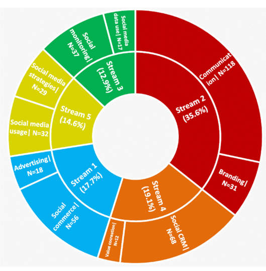
FIGURE 2 Evolution of social media marketing research.