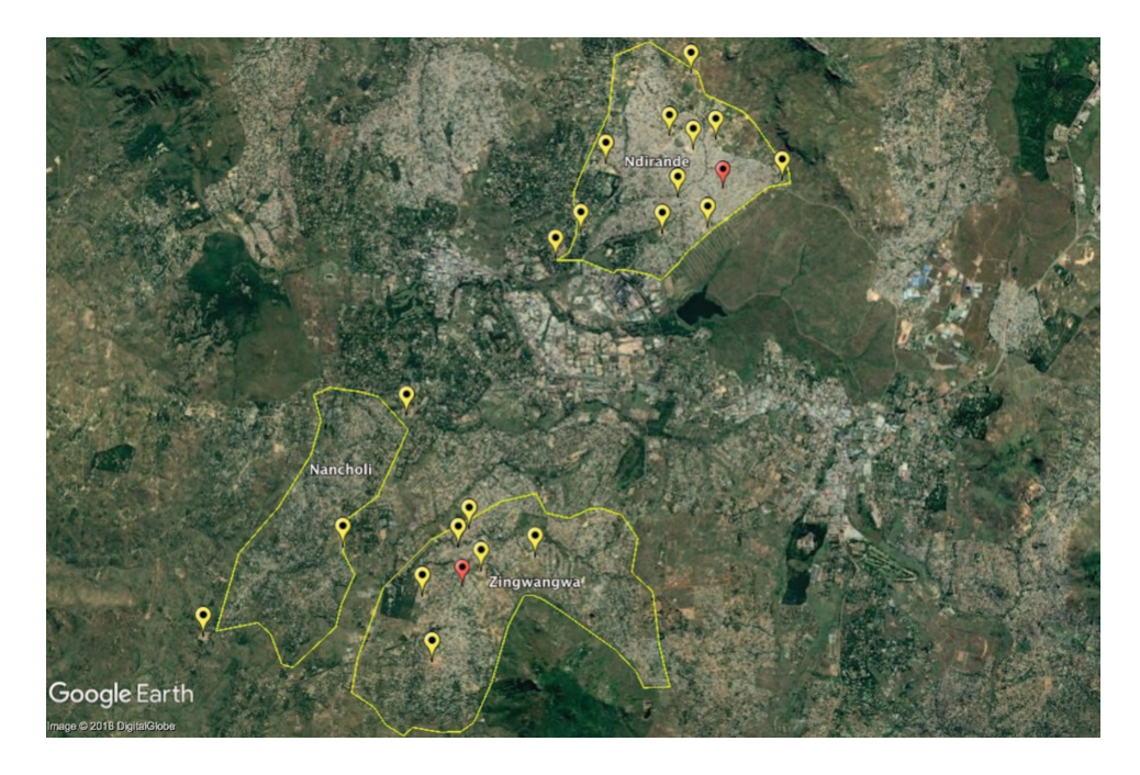
Figure 2. Blantyre city with Ndirande (upper middle), Zingwangwa (lower middle), and Nancholi (lower left) townships with schools (yellow), and health centers(red) located.

to use designated health and educational facilities for study activities. This permission and support were essential to gain facility access and be seen as a legitimate activity by the community. The taskforce involved 20 people and cost approximately $275 USD.