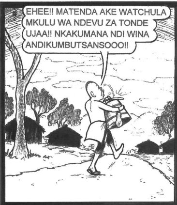
Figure 4. Kanjipiti Times Malawi national newspaper cartoon.

Translation: "Mothers, bring your children for research study of .....whatchamacallit....Tadi....ugghhh.....Tafiyo"