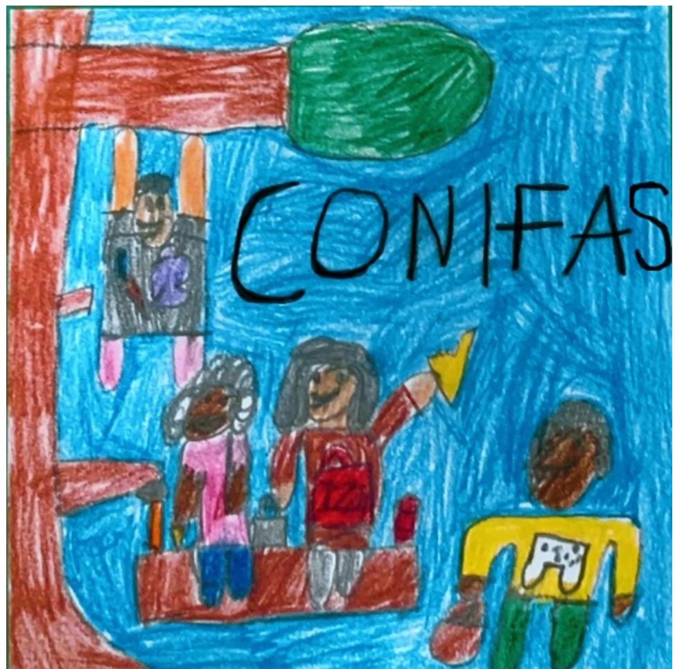
Fig 2. CONIFAS study logo based on the winning entry to the drawing competition.

Patient and public involvement (PPI) is central to CONIFAS. A parent of a child with ADHD, a professional from the ADHD foundation, and two professionals from the Yorkshire Wildlife Trust are co-investigators on the study. They have been involved in the development stages and they will be involved for the duration of the study. Key responsibilities for this PPI group will be to review all participant-facing documents and contribute to the Study Management Group (SMG). Participant-facing documents have also been reviewed by the sponsor's (LYPFT NHS) research patient ambassador. We also enhanced inclusivity and reach of our PPI strategy by holding a picture drawing competition for children and young people and this image is used to promote the visual identity of the study (Fig 2).