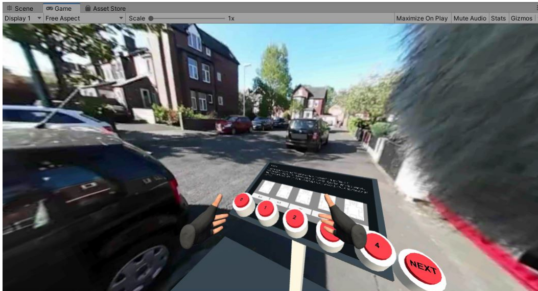
Figure 1: An implementation of a soundscape evaluation experiment as seen through the view of the software development environment. This view would be stereoscopically rendered for a participant wearing a head mounted display system. The view shows the visual stimuli of a 3D still image of a quiet street. The diegetic user interface presented to the participant is also visible, showing a section of the questionnaire and the buttons that participants can use to respond to the questionnaire. Finally the participant hand models are visible.

Though research into the use of VR systems in environment evaluation is in its infancy, large engineering organisations have begun to deploy the systems in large consultation schemes. Arup deployed virtual reality soundbooths as part of the consultation for new works being proposed to one of the primary UK airports [24]. Arup identified that the VR booths were intended to communicate what the proposed building works involved and how they would effect the local community.