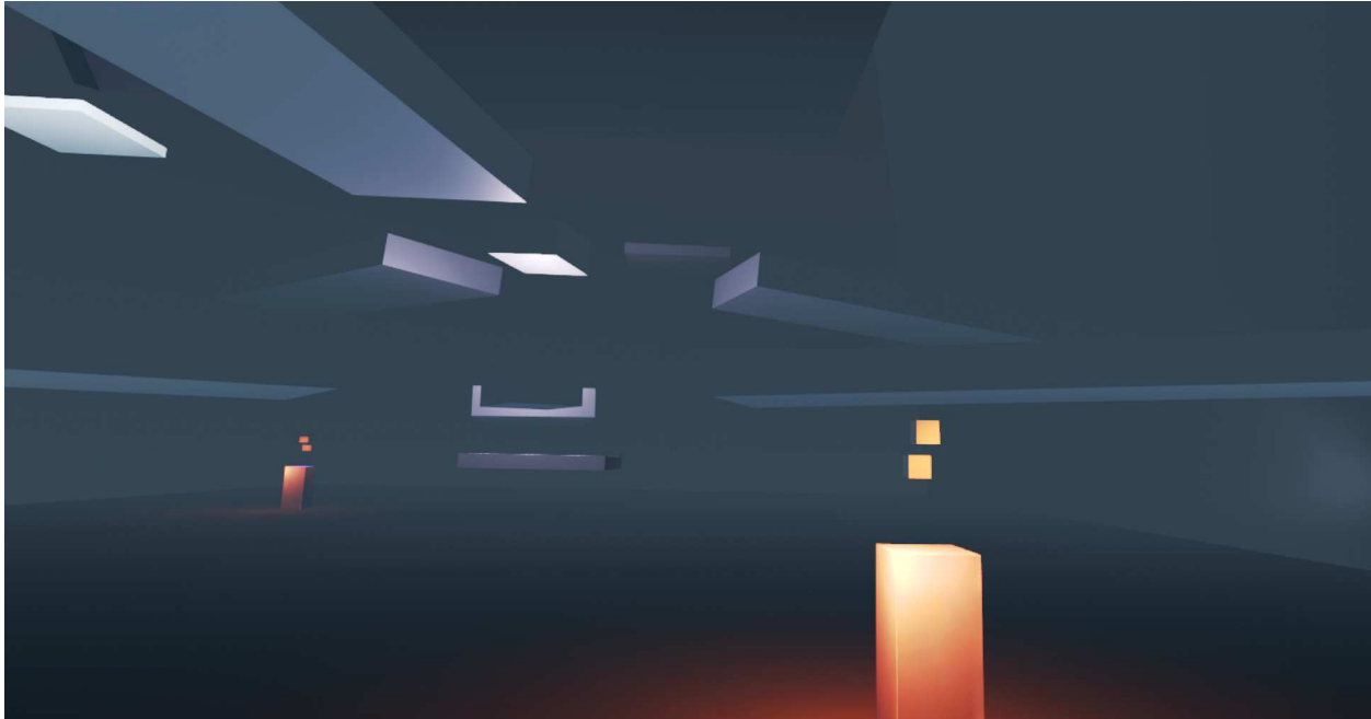
Figure 1: Example screenshot depicting two monoliths (front bottom right, back left) and two three-armed rotors (centre). The two rotors represent this area’s non-interactive main props.

constant between 0 and 2 m, falls quickly after 2 m and becomes inaudible by 7 m. This shape removes distance attenuation below 2 m. It allows the player to listen to the speech recording at a comfortable distance, reduces signal level fluctuations caused by player movement, and lessens the masking effects of reverberation. The quick fall-off makes distance attenuation audible and limits aural overlap with other speech sources. A further dip in the frequency spectrum of an environment’s louder sounds around 1.5-3 kHz, as recommended in [26, chap.4], clears spectral space for the speech’s consonants. The reverb’s level and decay time are adjusted to balance speech intelligibility with the space’s dimensions and narrative connotation.