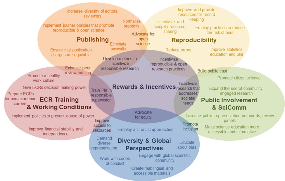
Fig 1. Themes of scientific reform efforts. Common themes of science reform work include publishing, reproducibility, public involvement and science communication, diversity and global perspectives, ECR training and working conditions, and rewards and incentives. This figure provides a general overview of some themes included in each topic and overlapping areas. It is impossible to display all themes and overlapping areas.

https://doi.org/10.1371/journal.pbio.3001680.g001