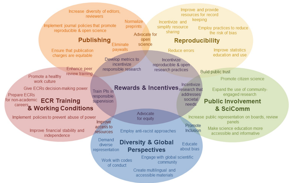
Fig 1. Themes of scientific reform efforts. Common themes of science reform work include publishing, reproducibility, public involvement and science communication, diversity and global perspectives, ECR training and working conditions, and rewards and incentives. This figure provides a general overview of some themes included in each topic and overlapping areas. It is impossible to display all themes and overlapping areas.

https://doi.org/10.1371/journal.pbio.3001680.g001