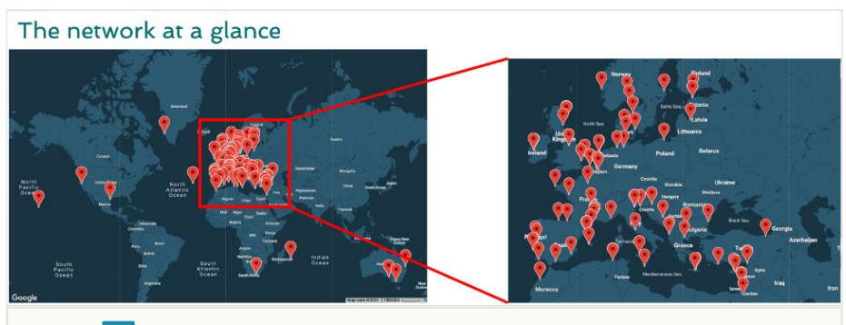
Figure 1. doi

unify and integrate the varied approaches to MFC under a common conceptual and analytical framework for improved management of marine resources and ecosystems.