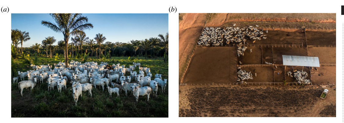
Figure 1. Contrasting beef systems in Brazil. ( a ) low-yielding pasture adjacent to rainforest and ( b ) a high-yielding feedlot system. To understand the relative EID risks of each system, it is important to consider the risks associated with both livestock management and land use.

farming may influence zoonosis emergence provides a powerful new perspective for evaluating the overall EID risk of different approaches to meeting demand for livestock products.